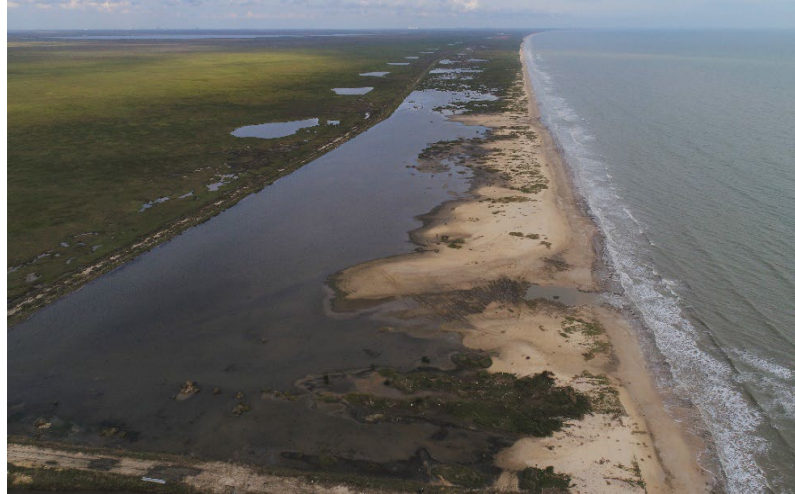
The Gulf of Mexico breaching the McFaddin NWR dunes and contaminating wetlands.

For the McFaddin Beach and Dune Project, the Trustees’ contractors are using methods that have proved highly successful in the past. Sediment is pumped to the beach from a borrow area located approximately 1.5 miles off the refuge’s coast. It is then graded to meet design specifications for the beach and dunes. Once the beach nourishment and sediment sculpting are completed, a contractor will plant native plants the restored dune system.