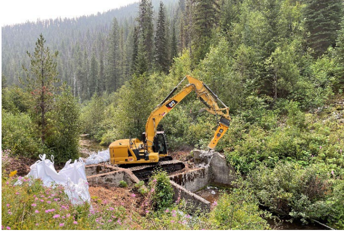
Red Ives Dam Removal, Upper St. Joe River

Completed the removal of an abandoned hydroelectric dam to provide for fish passage and improved 200' of streambank and aquatic habitat for bull and cutthroat trout. Began staging large woody debris for Phase II fish habitat improvement activities.