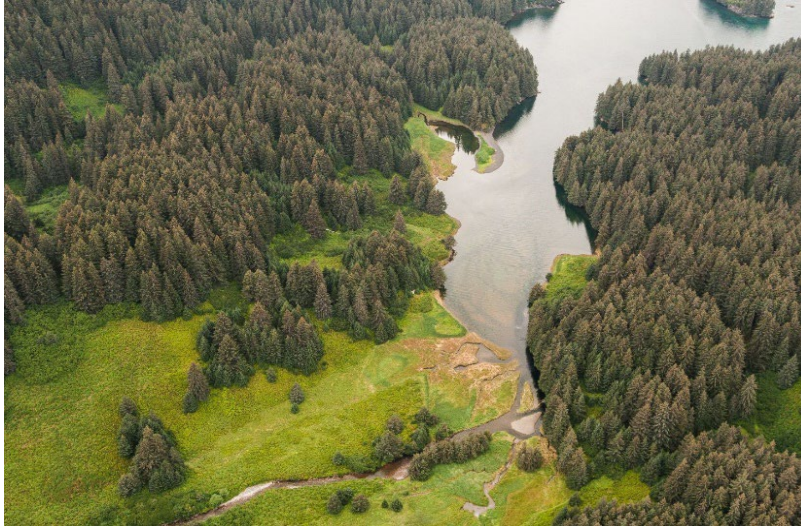
Mouth and estuary of Thorsheim Creek.

Archipelago. The conserved acreage is comprised of over 15 parcels of land and islands in different areas of the Archipelago. The surface estate in these areas had been previously protected with Trustee Council funds or other conservation actions due to their high values to supporting fish and wildlife and to the people who depend on these areas for subsistence, recreation, and overall ecological wellness. Now, the conservation of the subsurface estate ensures that extraction of