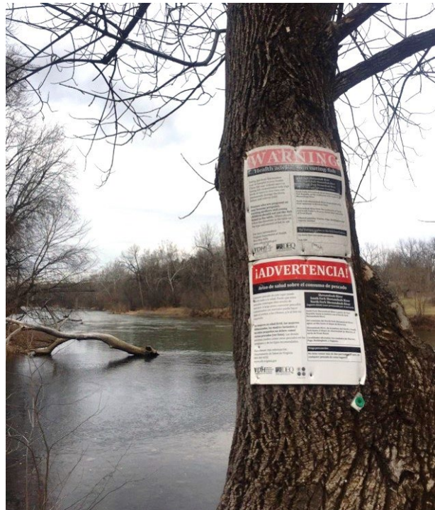
Fish consumption advisory sign warning of mercury contamination in the South River, VA

Damage assessment activities are an important first step taken by the Department on the path to achieving restoration of natural resources impaired through the release of hazardous substances. The source, effect, and magnitude of the impairment must first be identified, investigated, and thoroughly understood if the subsequent restoration is to be effective. Through the damage assessment process, physical and scientific evidence of the