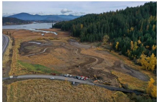
Cougar Bay on Coeur d'Alene Lake

Reconstructed a new meandering stream and associated wetlands to hydrologically reconnect the floodplain near the mouth of Cougar Creek. Diverting streamflow from the existing drainage ditch to the new channel benefits waterfowl, fish, and improves nutrient filtering and water quality into Lake Coeur d'Alene. Project activities included reducing reed canary grass and planting a variety of native trees and shrubs.