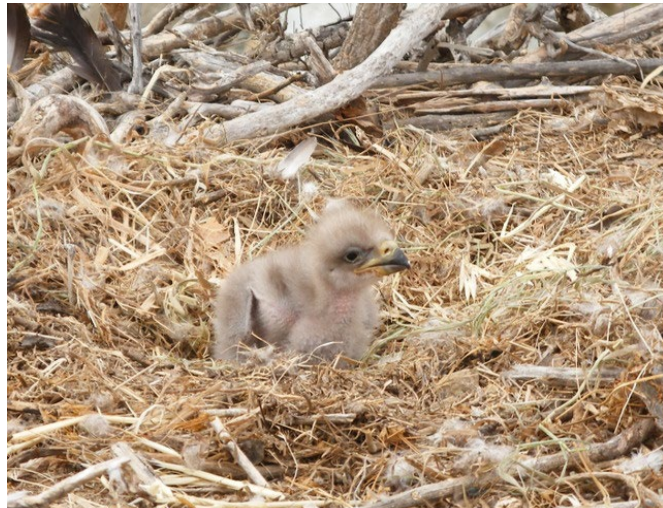
Bald eagle hatchling on the Channel Islands.

( https://explore.org/livecams/bald-eagles/bald-eagle-west-end-catalina )