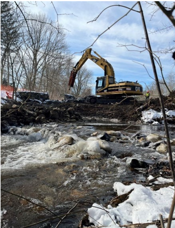
Mill Pond Dam removal.

On February 16, 2022, the Mill Pond Dam came down stone by stone, crumbling away and allowing Traphole Brook to run free for the first time in more than 170 years. While older dams can often look unassuming, they can have significant environmental impacts. The Mill Pond dam was an earthen dam approximately 100 feet long with a stone spillway and was the only known dam on the Traphole Brook.