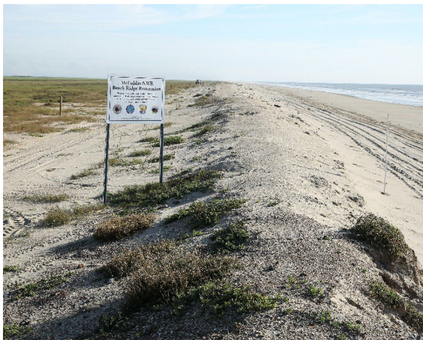
McFaddin NWR Dune and Ridge Pilot Project.

In December 2021, construction began on the Deepwater Horizon Natural Resource Damage Assessment Texas Trustee Implementation Group's McFaddin Beach and Dune Restoration Project, which includes restoring approximately 17 miles of degraded shoreline along the southern edge of McFaddin National Wildlife Refuge. The project will restore a beach and dune ridge barrier that historically protected the wetlands of the Salt Bayou. It is modeled after an extremely successful 2017 pilot project, which completed 2.9 miles of restored shoreline in the same area.