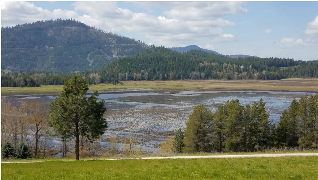
Canyon Marsh Complex, Lower Coeur d'Alene River

Finalized three conservation easements with private landowners on drained agricultural land that will eventually be converted to functional wetlands. Initiated discussions with the U.S. Environmental Protection Agency about future opportunities for remediation to provide clean habitat for waterfowl and other wetland dependent species. Assessed water and vegetation management techniques that could be used to optimize waterfowl feeding habitat in areas with low levels of contamination.