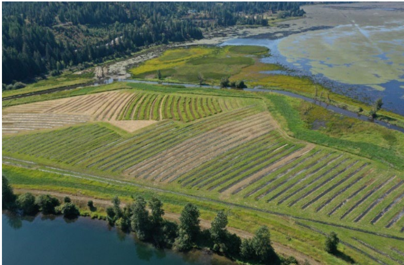
Native Willow Nursery, St. Joe River near Hepton Lake

The Coeur d'Alene trustees established a nursery for native willow species to provide a low cost, steady supply of cuttings for riparian and floodplain restoration projects sponsored by the Coeur d'Alene Basin Natural Resource Trustees. To date, the nursery has supplied cuttings for Bureau of Land Management, and Idaho Fish & Game restoration projects. Most importantly, this project addresses lost cultural and traditional uses of willows in