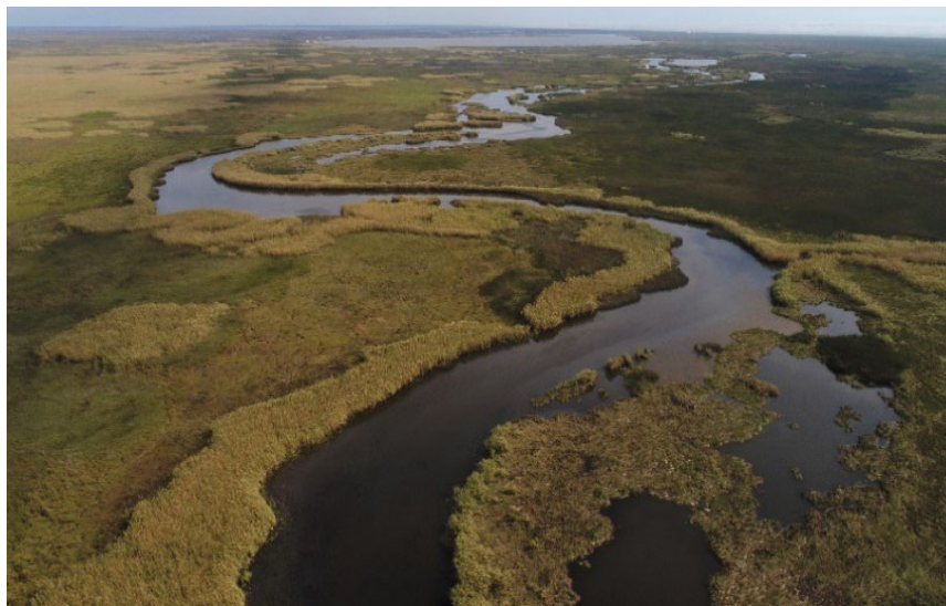
Wetlands of McFaddin National Wildlife Refuge.

The McFaddin Beach and Dune Project was approved in the Texas Trustee Implementation Group Final 2017 Restoration Plan / Environmental Assessment and includes a budget of approximately $18.3 million, which comes from the Deepwater Horizon NRDA settlement.