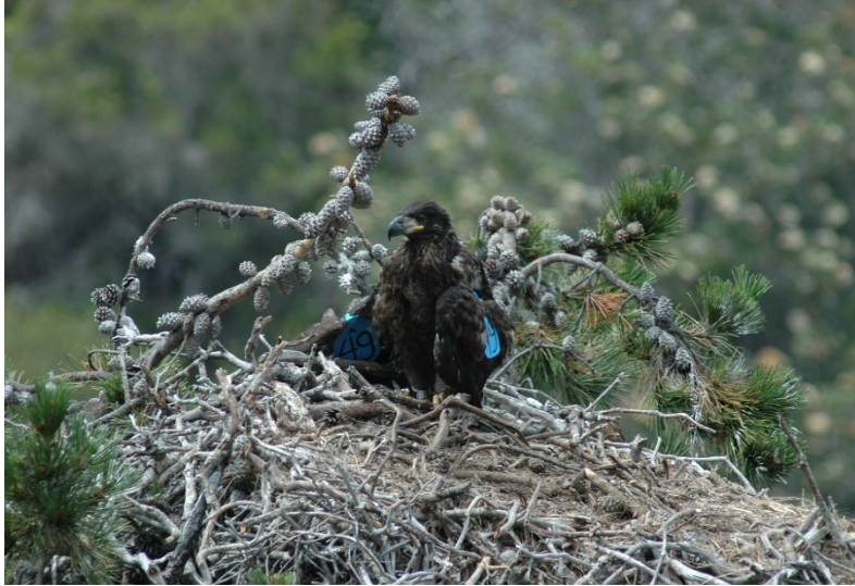
A-49 banding day in nest.

2021 season included 20 known bald eagle breeding pairs producing 25 chicks of which 23 successfully fledged. In 2021, bald eagles were nesting on five of the eight Channel Islands, including Santa Catalina, San Clemente, Santa Cruz, Santa Rosa, and Anacapa Islands. The last comprehensive survey for peregrine falcons was in 2017 which document a total of 48 occupied peregrine falcon territories across all eight Channel Islands. This is a significant increase compared to the 2007 survey which documented 27 nesting territories. A minimum of 58