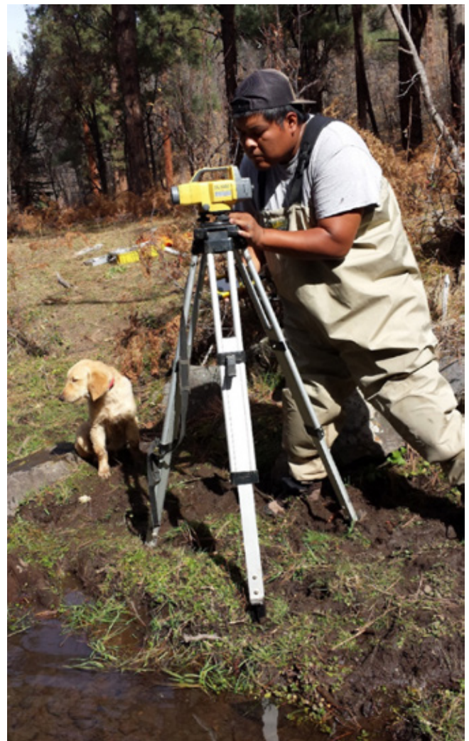
Native American intern participates in BIA's Water Resources Technician Training program.

BIA's Office of Justice Services (OJS) funds law enforcement, corrections, and court services to support safe Tribal communities. The 2024 budget