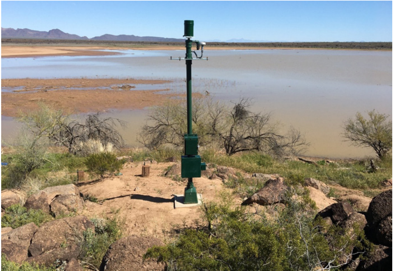
An Early Warning Systems site at Menager's Dam in Tohono O'odham Nation provides monitoring data reports of hydrologic conditions at the dam.