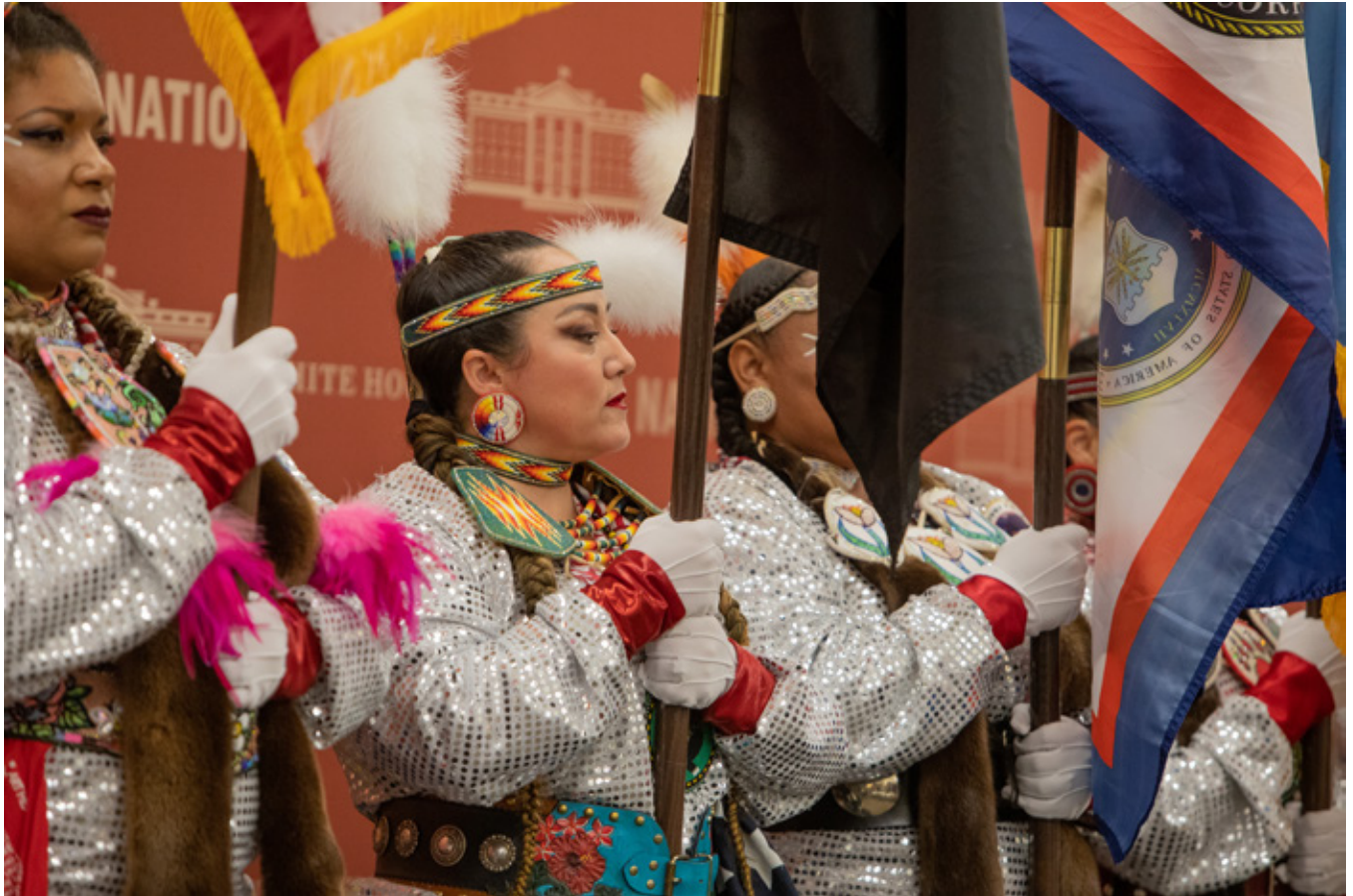
The Department of the Interior hosted the 2022 White House Tribal Nations Summit.

Fixed costs of $49.4 million are fully funded.