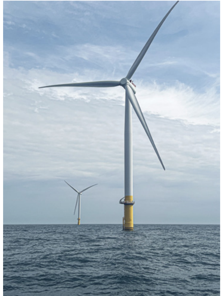
Coastal Virginia Offshore Wind Project.

The 2024 budget requests $22.3 million for Executive Direction, $3.4 million above the 2023 enacted level, which supports BOEM-wide leadership, direction, management, coordination,