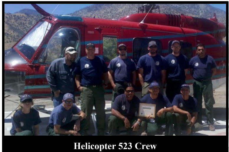
Helicopter 523 Crew

Helicopter 523 was dispatched last fire season and during size up of the fire the aircraft encountered strong and erratic winds. The decision was made to land in a safe area and wait until the winds subsided. The crew also advised other incoming aircraft of the situation and to stay away. Lesson Learned— Good job to the aircraft crew in quickly recognizing their situation and making a decision to wait and sharing the situation with other aircraft. SAFECOM11-0320