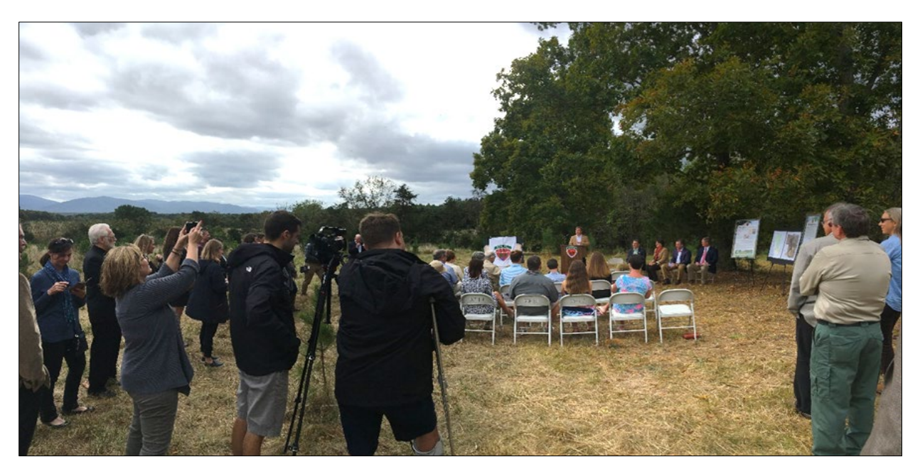
The State Forester of Virginia and other Virginia state officials hosted the celebration and dedication of the new First Mountain State Forest.

Forestry, made the 573-acre acquisition possible. This project will provide water quality improvements, protection of habitat and restoration of forest, and recreational access and opportunities.