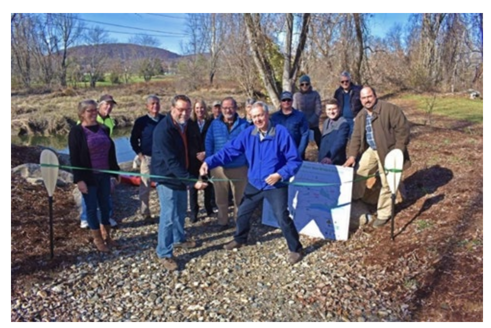
New Milford, CT city officials and Housatonic Valley Association (HVA) officials are joined by canoeing and kayaking enthusiasts for a ceremonial ribbon cutting launching the new water trail.

opportunities as part of the Housatonic River NRDAR settlement. While the new launch did provide access to the Still River, paddlers were not able to paddle downriver to the confluence with the Housatonic River due to the presence of the falls at Harrybrooke Park. In October 2019, with additional Housatonic River NRDAR settlement dollars, the HVA, in cooperation with the Town and other