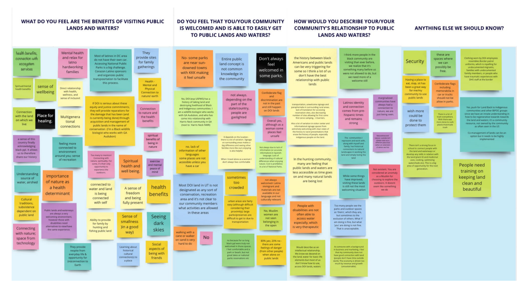
Figure 1: Perceptions Miro Board Screenshot

This Appendix features participant responses to a DOI listening session on Underserved Community Recreation Access to DOI-managed Public Lands and Waters on October 25, 2021, from 5:00 pm- 7:00 pm ET. The sticky notes included on the boards reflect participants' own words, experiences, reflections, and recommendations.