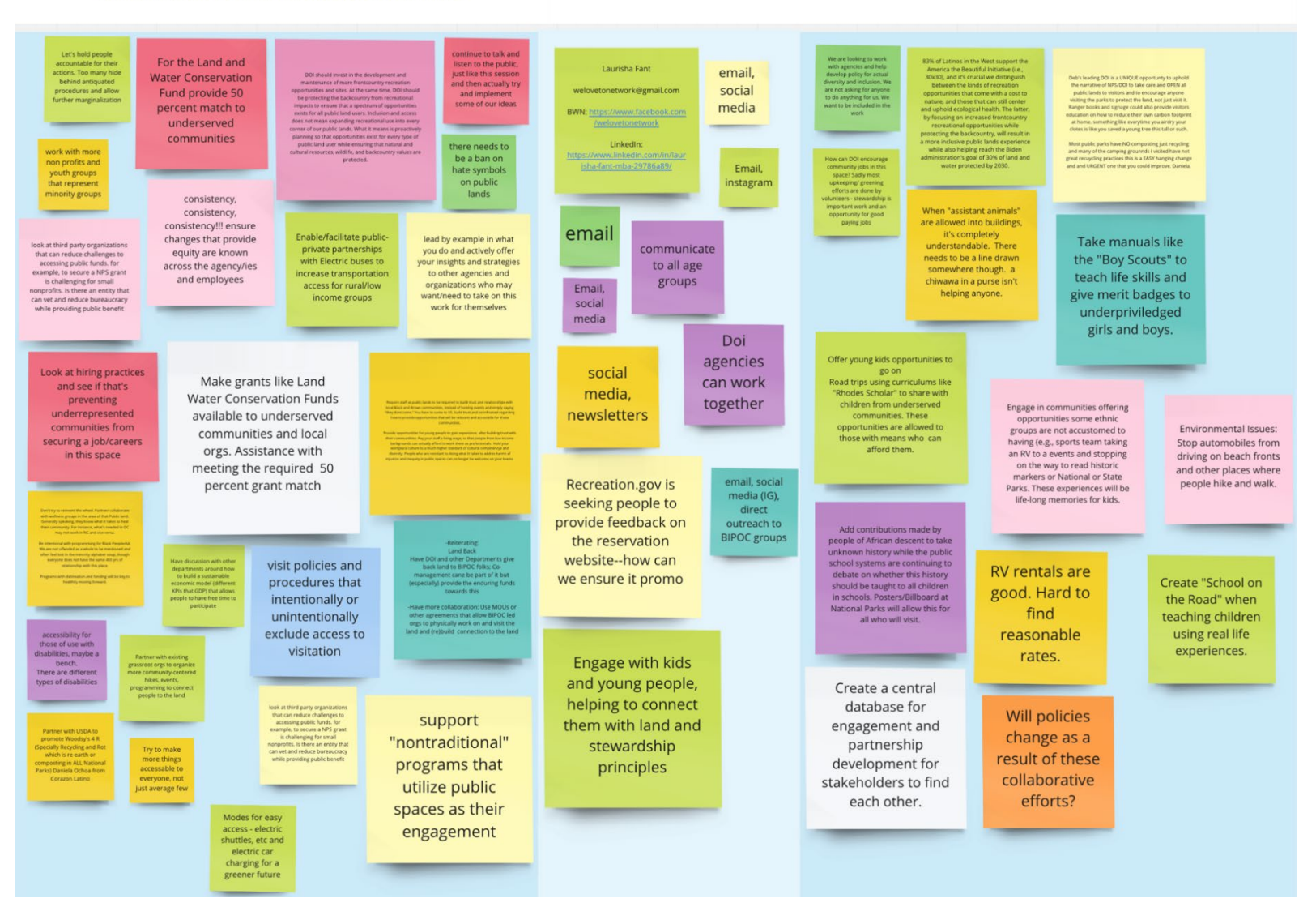
Figure 4: Recommendations Miro Board Screenshot