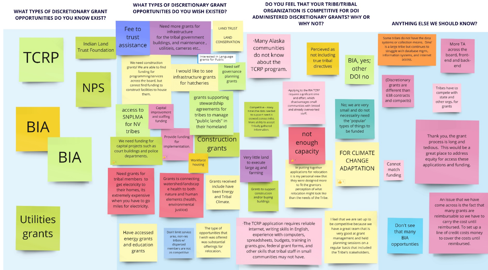
Figure 1: Perceptions Miro Board Screenshot

This Appendix features participant responses to a DOI listening session on Tribal Discretionary Grants on October 27, 2021, from 5:00 pm- 7:00 pm ET. The sticky notes included on the boards reflect participants' own words, experiences, reflections, and recommendations.