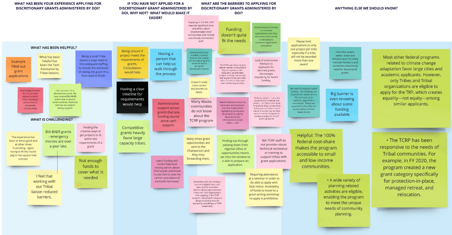
Figure 2: Barriers Miro Board Screenshot