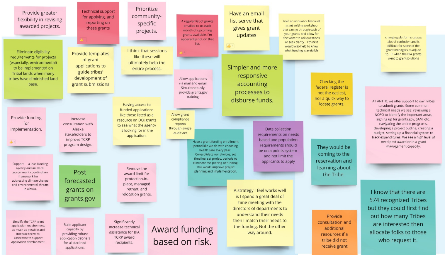
Figure 3: Recommendations Miro Board Screenshot