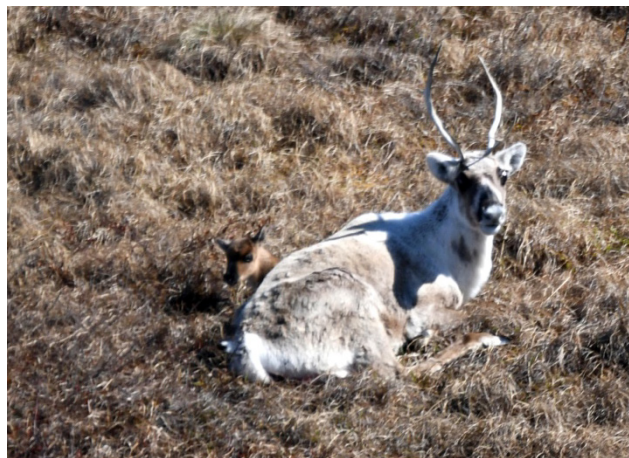
A Western Arctic Herd female and her newborn calf.

Caribou are well-known for returning to calving areas each spring, but why do they use those particular places? Researchers at the National Park Service and University of Alaska - Fairbanks set out to investigate this question for Alaska's largest caribou herd, the Western Arctic Herd, that lives in northwest Alaska. They determined where females delivered their calves using GPS collar data from 2010 through 2017, calculated the calving area for each year, and then compared each calving area to every other year to see how consistent they were. Lastly, they used satellite