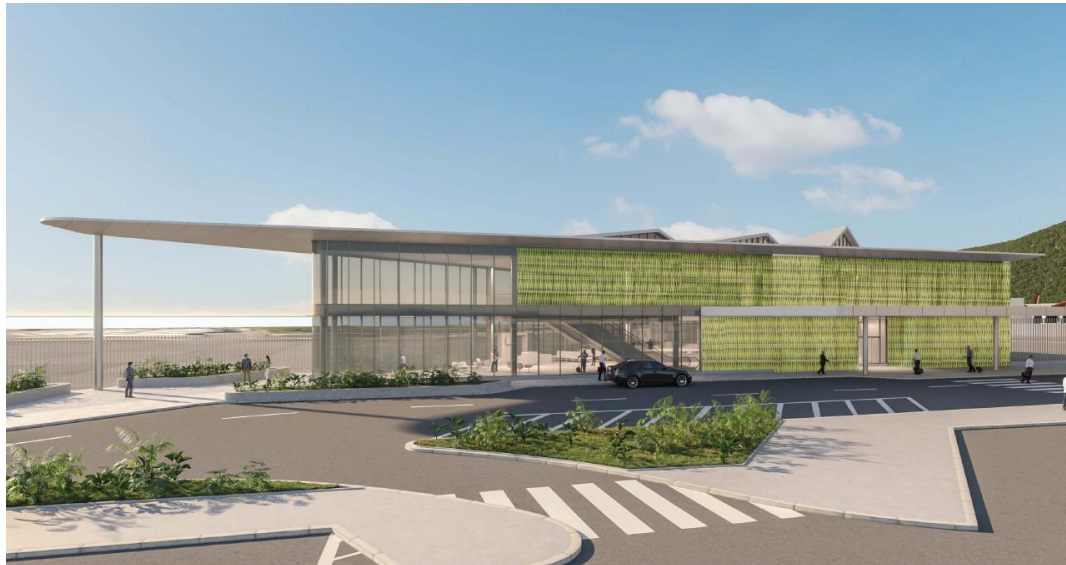
Cyril E. King International Airport (STT) - Airport Terminal Expansion