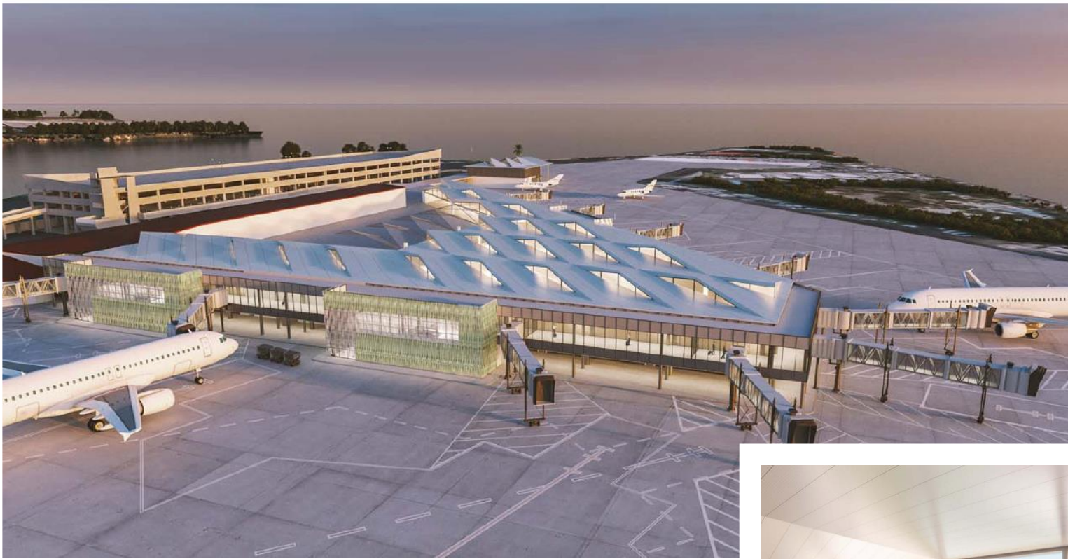
North Exterior View and Interior View of Terminal (second floor gate area)