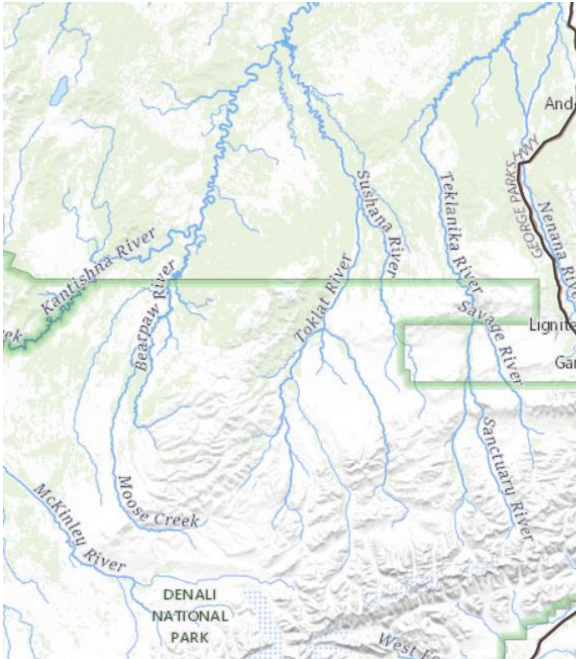
Figure 1. Toklat River from headwaters to confluence with the Kantishna River. Federal waters occur within Denali National Park (BLM 2020).