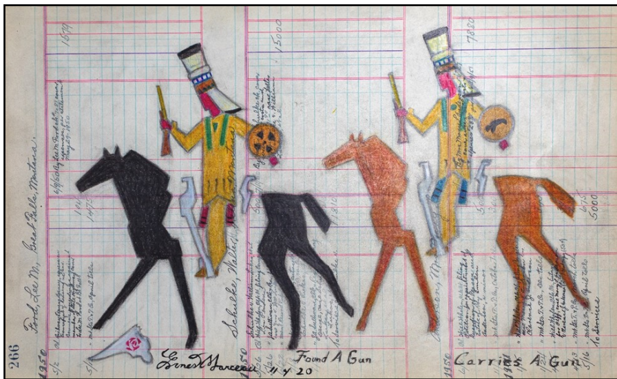
Found a Gun, Carries a Gun Oil Pencil on Ledger Paper © 2020 Ernest Marceau