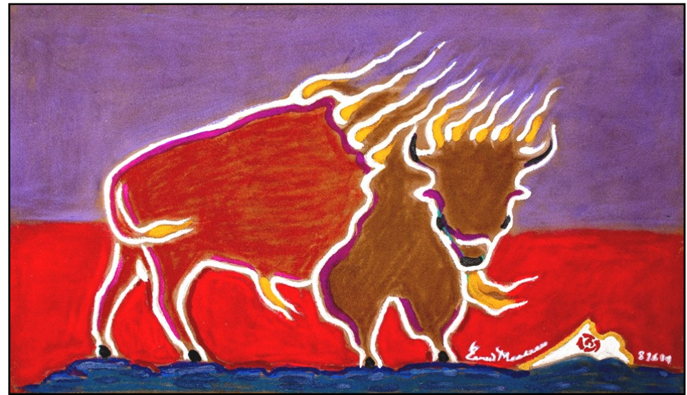
Little Bull Pastel and Acrylic on Velvet © 2019 Ernest Marceau