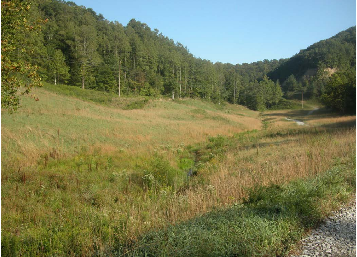
Reclaimed Crane's Nest Gob pile in Wise County, VA. This AML Small Project Award winner cost less than $4,000 and featured a donation of 3,600 planted trees.

for Tribes without approved regulatory programs. This amount includes an increase of $1.5 million to establish a Federal regulatory program for Tribes in Oklahoma, as required by the July 2020 decision by the Supreme Court in the case of McGirt v. Oklahoma .