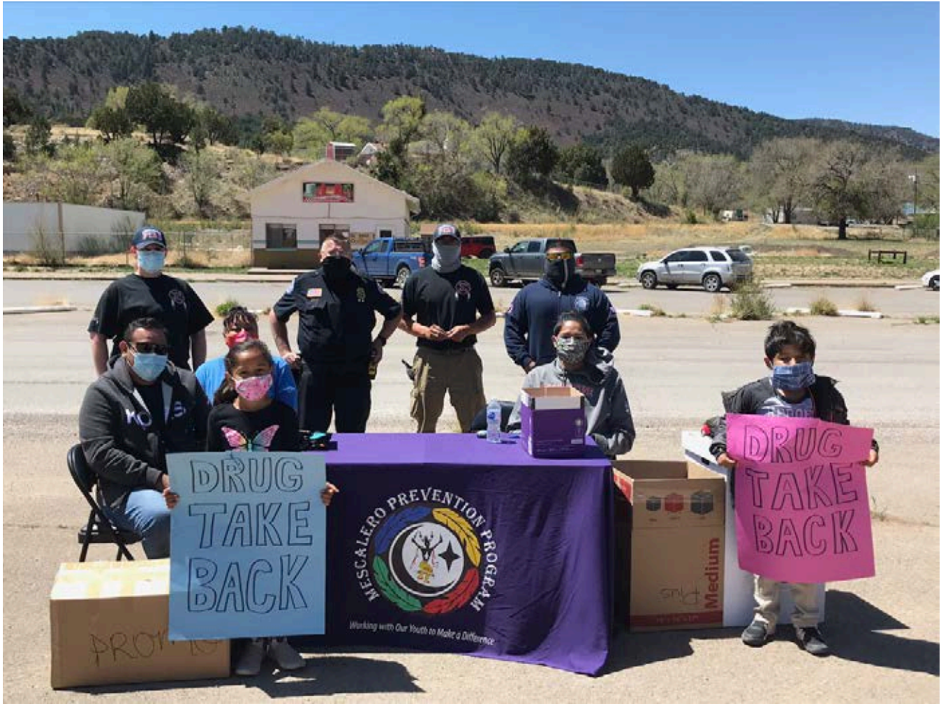
Drug Take Back Day, BIA Mescalero Agency, New Mexico.