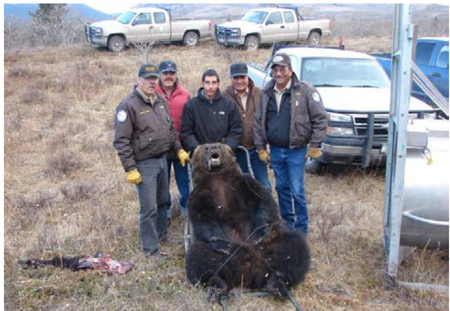
Blackfoot Tribal game wardens and Grizzly Management staff in Montana cart a tranquilized grizzly from a culvert trap for health sampling and physiology condition assessment before being released back into resident habitat and range. The BIA Tribal Management and Development Program provides fish and wildlife management funds for the Tribe's conservation efforts.

The 2023 budget funds the Community and Economic Development activity at $72.3 million to advance economic opportunities in Indian Country. Job Placement and Training is funded at $23.8 million and includes $10.0 million for