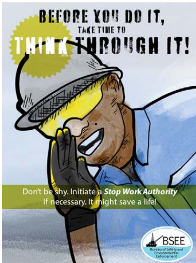
This poster is one of several in BSEE's "Lift Your Awareness" campaign focusing on crane, or lifting, safety.