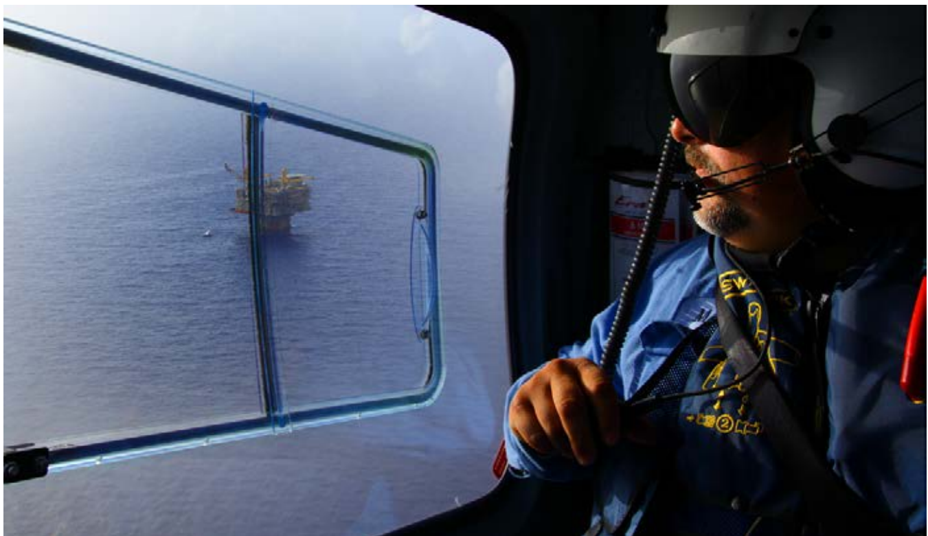
BSEE inspectors play a pivotal role in ensuring that offshore operations are conducted in a safe and environmentally sustainable manner.