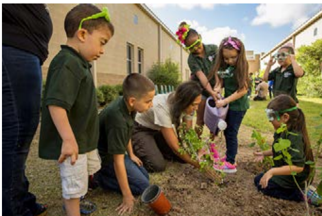
Elementary school students help plant a pollinator garden at Santa Ana National Wildlife Refuge in Texas.

FWS provides international conservation grants and technical support to assist other countries’ conservation and climate change adaptation and