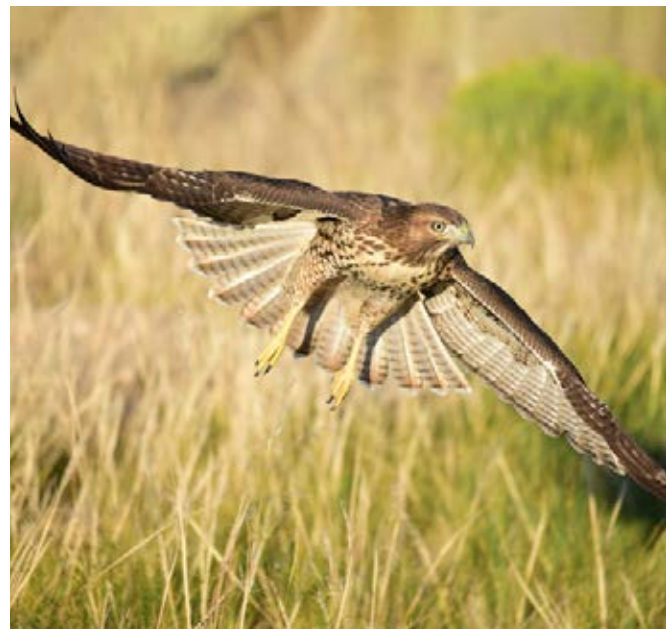
Juvenile red-tailed hawk at Seedskaadee National Wildlife Refuge in Wyoming.

Fixed-cost increases of $39.5 million are fully funded.