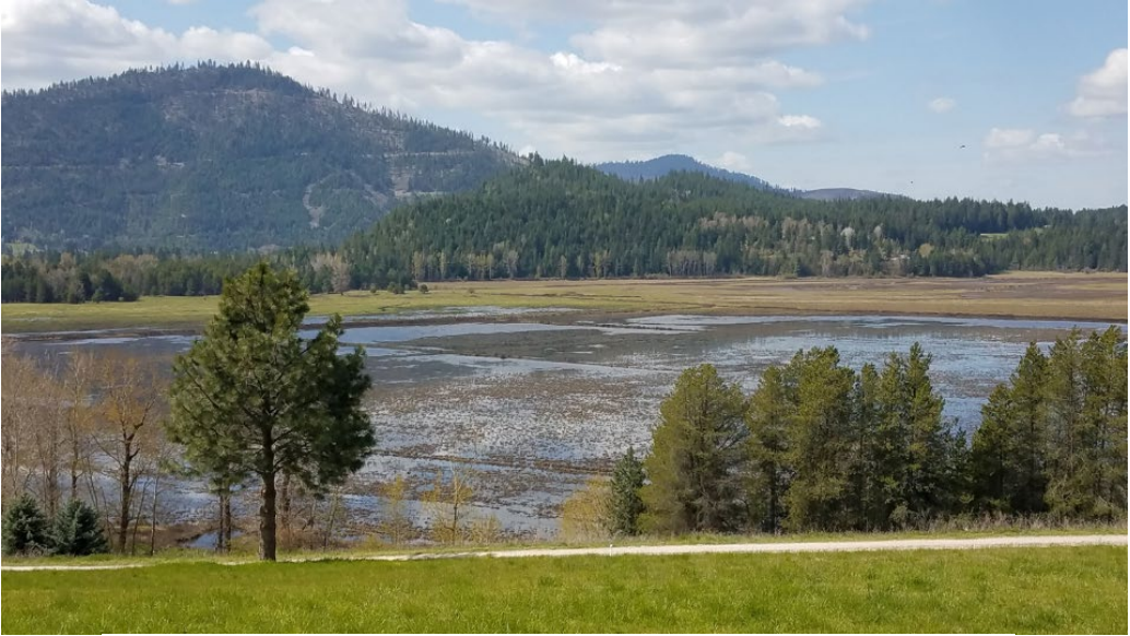
Canyon Marsh Complex, Lower Coeur d'Alene River

Finalized three conservation easements with private landowners on drained agricultural land that will eventually be converted to functional wetlands. Initiated discussions with the U.S. Environmental Protection Agency about future opportunities for remediation to provide clean habitat for waterfowl and other wetland dependent species. Assessed water and vegetation management techniques that could be used to optimize waterfowl feeding habitat in areas with low levels of contamination.