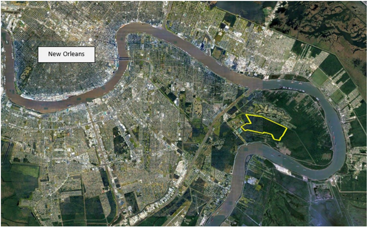
649 acres of forested wetlands (outlined above) acquired and preserved by funds from the 2021 Barge DM932 NRDAR settlement.

In early 2022, American Commercial Barge Line, LLC purchased 649 acres of forested wetland in Belle Chasse, Louisiana from the Plaquemines Parish government and donated it to the Woodlands Conservancy for permanent protection and management. Given the land losses expected during the next 30-45 years due to coastal erosion and development, the property is likely to be one of the largest intact forested land masses remaining between the Gulf of Mexico and the city of New Orleans. The property supports many species of migratory birds, 200-year-old bald cypress trees, and features 10 miles of hiking and equestrian trails.