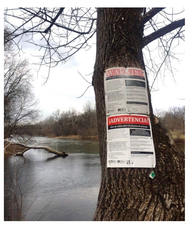
Fish consumption advisory sign warning of mercury contamination in the South River, VA

Damage assessment activities are an important first step taken by the Department on the path to achieving restoration of natural resources impaired through the release of hazardous substances. The source, effect, and magnitude of the impairment must first be identified, investigated, and thoroughly understood if the subsequent restoration is to be effective. Through the damage assessment process, physical and scientific evidence of the