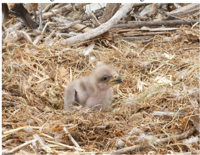
Bald eagle hatchling on the Channel Islands.

reintroduced back to the Channel Islands. The Institute for Wildlife Studies crew are already across the Channel Islands monitoring bald eagles and peregrine falcons for 2022. As of March 2022, three of the bald eagle nests which the public can view online through real-time nest cameras had nesting pairs including: Two Harbors and West End on Catalina Island; and Sauces Canyon on Santa Cruz Island. The West End nest successfully hatched three chicks in mid-March. (https://explore.org/livecams/baldeagles/bald-eagle-west-end-catalina)