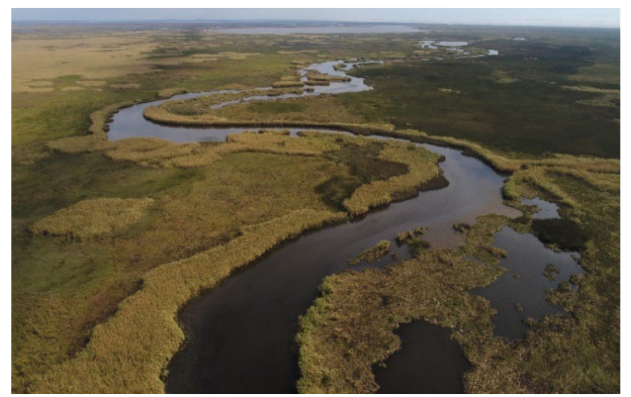
Wetlands of McFaddin National Wildlife Refuge.

The McFaddin Beach and Dune Project was approved in the Texas Trustee Implementation Group Final 2017 Restoration Plan / Environmental Assessment and includes a budget of approximately $18.3 million, which comes from the Deepwater Horizon NRDA settlement.