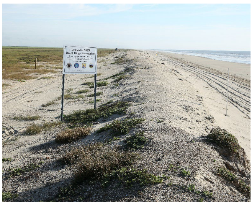
McFaddin NWR Dune and Ridge Pilot Project.

In December 2021, construction began on the Deepwater Horizon Natural Resource Damage Assessment Texas Trustee Implementation Group's McFaddin Beach and Dune Restoration Project, which includes restoring approximately 17 miles of degraded shoreline along the southern edge of McFaddin National Wildlife Refuge. The project will restore a beach and dune ridge barrier that historically protected the wetlands of the Salt Bayou. It is modeled after an extremely successful 2017 pilot project, which completed 2.9 miles of restored shoreline in the same area.