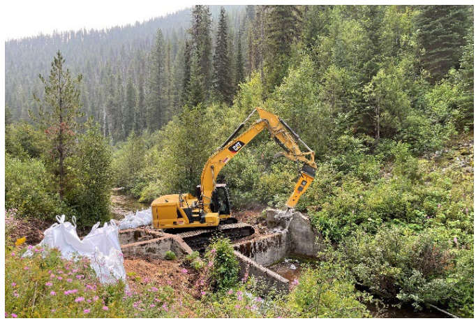
Red Ives Dam Removal, Upper St. Joe River

Completed the removal of an abandoned hydroelectric dam to provide for fish passage and improved 200' of streambank and aquatic habitat for bull and cutthroat trout. Began staging large woody debris for Phase II fish habitat improvement activities.