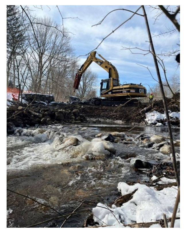
Mill Pond Dam removal.

On February 16, 2022, the Mill Pond Dam came down stone by stone, crumbling away and allowing Traphole Brook to run free for the first time in more than 170 years. While older dams can often look unassuming, they can have significant environmental impacts. The Mill Pond dam was an earthen dam approximately 100 feet long with a stone spillway and was the only known dam on the Traphole Brook.