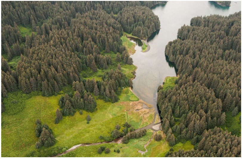
Archipelago. The conserved acreage is comprised of over 15 parcels of land and islands in different areas of the Archipelago. The surface estate in these areas had been previously protected with Trustee Council funds or other conservation actions due to their high values to supporting fish and wildlife and to the people who depend on these areas for subsistence, recreation, and overall ecological wellness. Now, the conservation of the subsurface estate ensures that extraction of