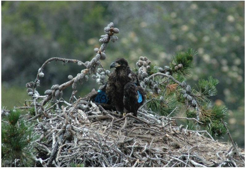
A-49 banding day in nest.

2021 season included 20 known bald eagle breeding pairs producing 25 chicks of which 23 successfully fledged. In 2021, bald eagles were nesting on five of the eight Channel Islands, including Santa Catalina, San Clemente, Santa Cruz, Santa Rosa, and Anacapa Islands. The last comprehensive survey for peregrine falcons was in 2017 which document a total of 48 occupied peregrine falcon territories across all eight Channel Islands. This is a significant increase compared to the 2007 survey which documented 27 nesting territories. A minimum of 58