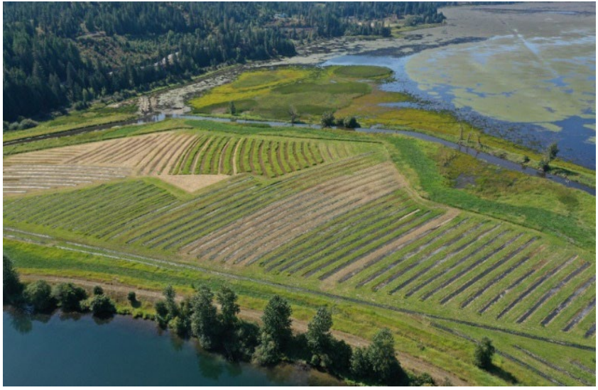
Native Willow Nursery, St, Joe River near Hepton Lake

The Coeur d'Alene trustees established a nursery for native willow species to provide a low cost, steady supply of cuttings for riparian and floodplain restoration projects sponsored by the Coeur d'Alene Basin Natural Resource Trustees. To date, the nursery has supplied cuttings for Bureau of Land Management, and Idaho Fish & Game restoration projects. Most importantly, this project addresses lost cultural and traditional uses of willows in