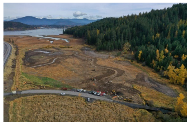
Cougar Bay on Coeur d'Alene Lake

Reconstructed a new meandering stream and associated wetlands to hydrologically reconnect the floodplain near the mouth of Cougar Creek. Diverting streamflow from the existing drainage ditch to the new channel benefits waterfowl, fish, and improves nutrient filtering and water quality into Lake Coeur d'Alene. Project activities included reducing reed canary grass and planting a variety of native trees and shrubs.