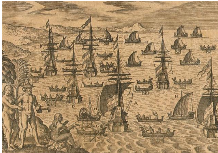
CHamoru warriors and Spanish explorers on Guam in the 1500's.

Mau Piailug left a legacy in Native Hawai'ian Master Navigator Nainoa Thompson , who traveled around the world in the Mālama Honua Worldwide Voyage from 2013 to 2019, to share a message of caring for the earth and sustainable living. A community-based organization in Yap called Wa'agey , also inspired by Mau, teaches canoe carving and traditional navigation among other traditional skills.