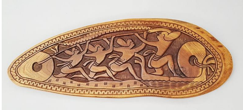
Palau story board with Yapsee navigators. U.S. Department of the Interior Museum, INTR 02158

Mau Piailug left a legacy in Native Hawai'ian Master Navigator Nainoa Thompson , who traveled around the world in the Mālama Honua Worldwide Voyage from 2013 to 2019, to share a message of caring for the earth and sustainable living. A community-based organization in Yap called Wa'agey , also inspired by Mau, teaches canoe carving and traditional navigation among other traditional skills.