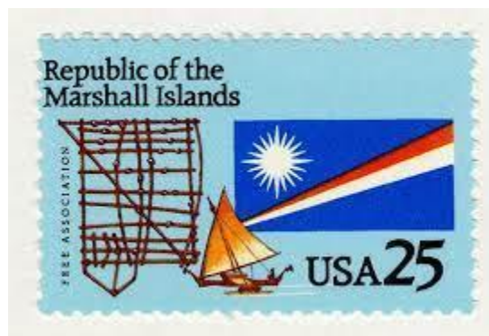
Stick chart, canoe, and Marshall Islands flag on postal stamp

Across the Micronesia region, one can still see different representations of an ancient navigating history. The Marshall Islands have stick chart handicrafts, with wood and shells representing currents and waves. They also tell ancient legends of racing canoes to choose kings. Today, the Waan Aelōñ in Majel program uses the canoe to revive and teach ancient life-sustaining skills to Marshallese youth.