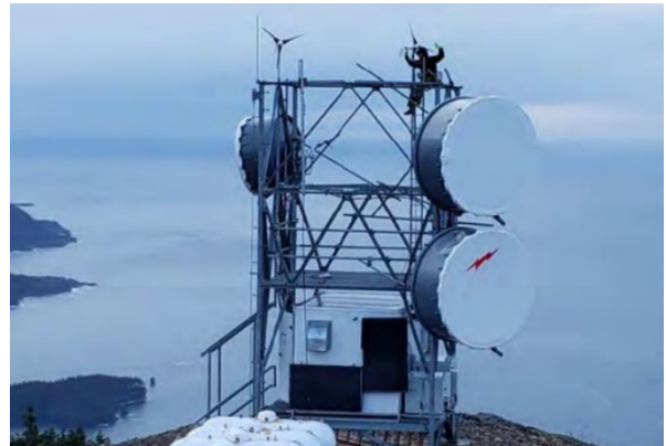
Figure 1: example of tower similar to those proposed for this project.

We welcome the council's input. We have reached out for input from Tribes and have not heard strong concerns at this point. We will reach out to Tribes and other regional partners again when we have a draft 810 analysis to share.