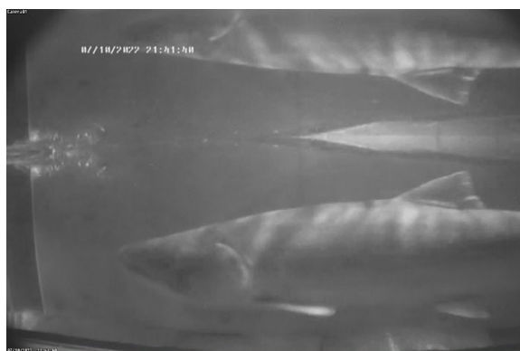
Underwater Image of Sockeye Salmon Passing the Tanada Creek Weir, 2022