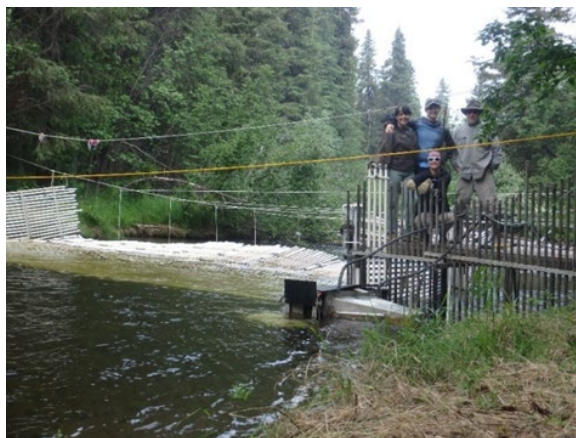
Photo of Tanada Creek Salmon Weir and Crew, 2022