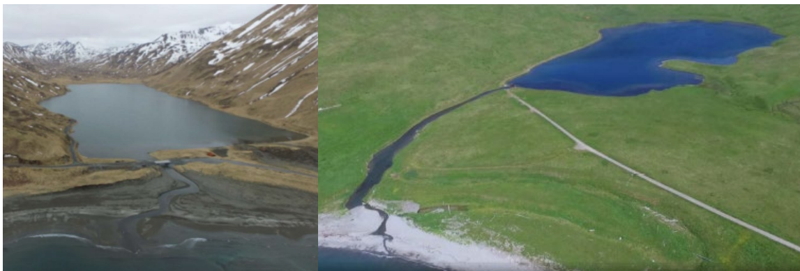
Figure 2. Aerial images of Summer (left) and Morris (right) lakes. Both systems are accessible through the road system.