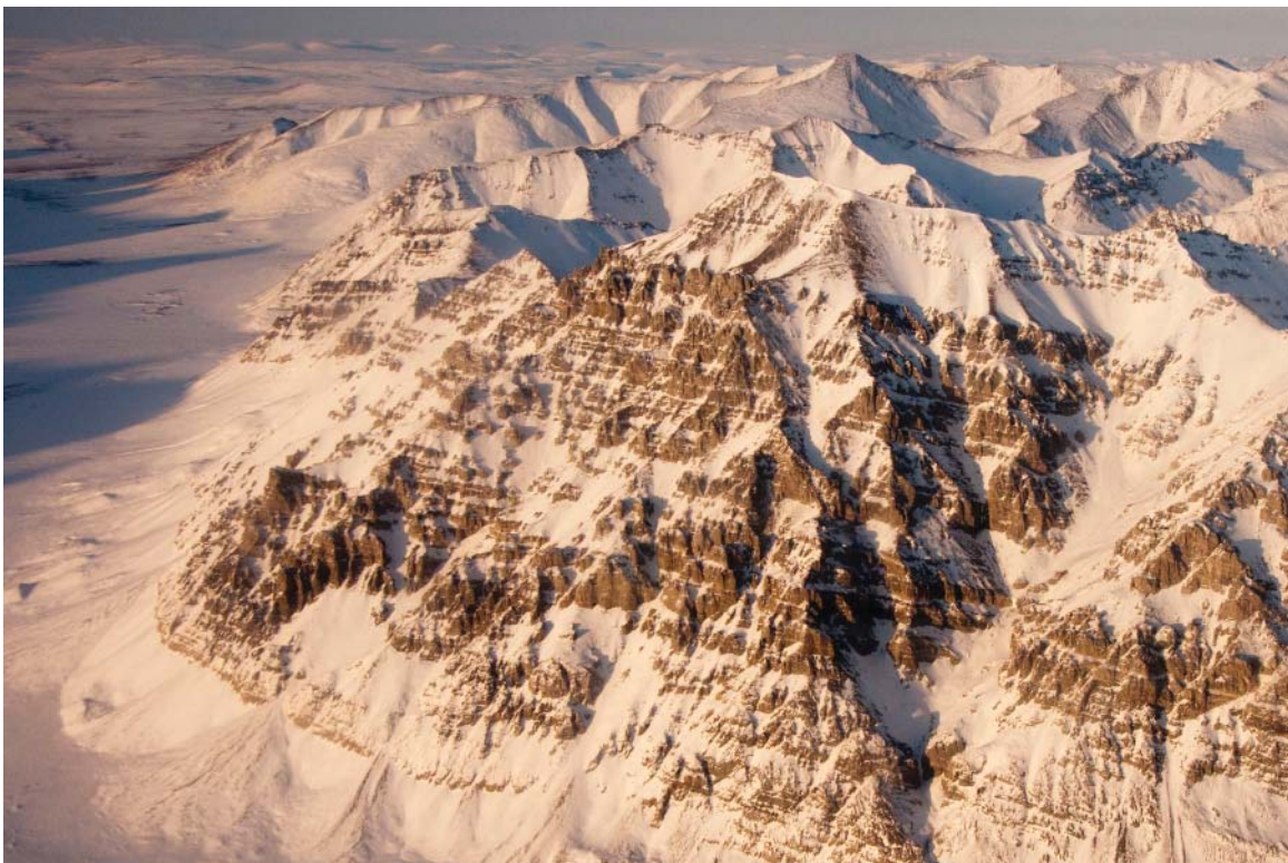
Mt. Stuver in the Brooks Range near the village of Anaktuvuk Pass.