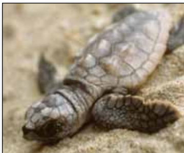
Loggerhead hatchling hits the beach.

Scientists from the U.S. Fish and Wildlife Service, the Florida Fish and Wildlife Conservation Commission, the National Park Service and NOAA devised the rescue plan rather than risk the hatchlings encountering oil as they entered the Gulf of Mexico. Sea turtle