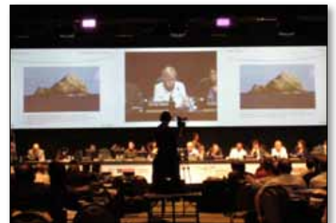
Announcement of the inscription of Papahānaumokuākea as a U.N. World Heritage Site, July 30, 2010, at the UNESCO Conference in Brasilia, Brazil.

Secretary of the Interior Ken Salazar commended the World Heritage Committee for adding