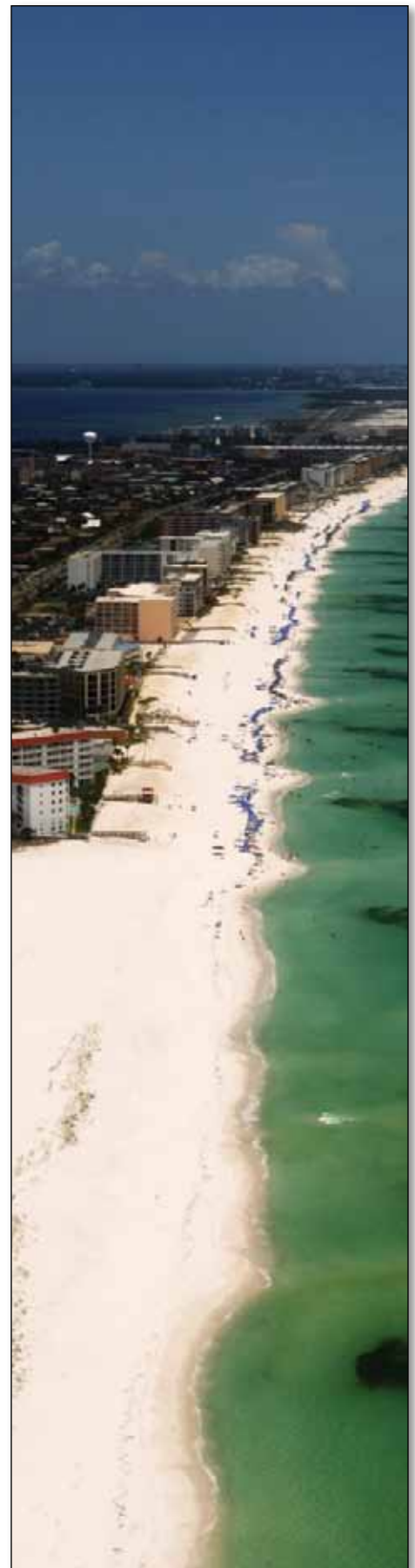
Bird's eye view of the coastline along the northern Gulf of Mexico, Santa Rosa Island, FL.