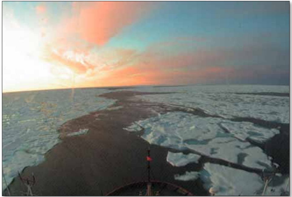
An image from the Arctic Ocean. The view of ocean, ice and sky across the horizon, as seen from the U.S. Coast Guard Cutter Healy on August 8, 2010.

http://www.whitehouse.gov/files/documents/2010stewardship-eo.pdf