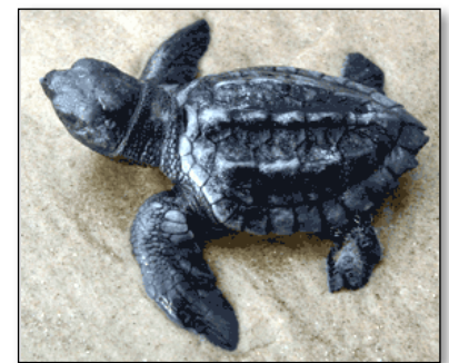
An endangered leatherback turtle hatchling.

Story from: http://www.doi.gov/news/pressreleases/Relocated-Sea-Turtle-Hatchlings-Released-into-Atlantic-Ocean.cfm and The Fish and Wildlife Refuge System’s “Refuge Update” www.fws.gov/refuges