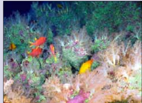
Fish and corals living at the summit of East Diamante volcano, nicknamed "The Aquarium", by scientists. Carbon dioxide bubbles (top left) and the white chimneys (bottom left) of the NW Eifuku volcano. (all photos courtesy of NOAA).