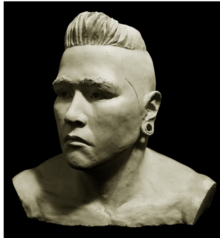
The Bust Clay © 2017 Benjamin Blackstar