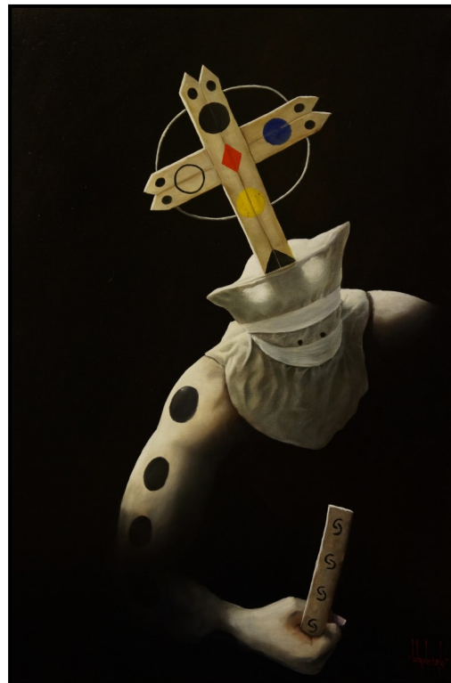
Mountain Spirit Number Three Oil on canvas © 2015 Benjamin Blackstar