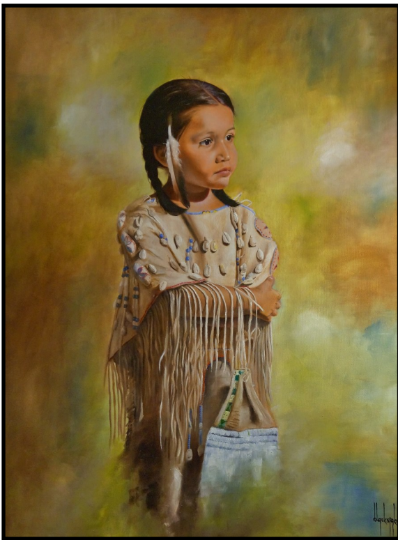
Untitled Oil on canvas © 2016 Benjamin Blackstar