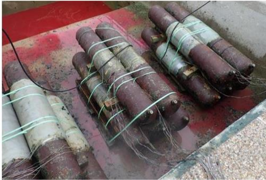
Photograph of samples after completion of 10,000 hour hold.

required to confidently use a composite repair inspection technology as part of an integrity management program.