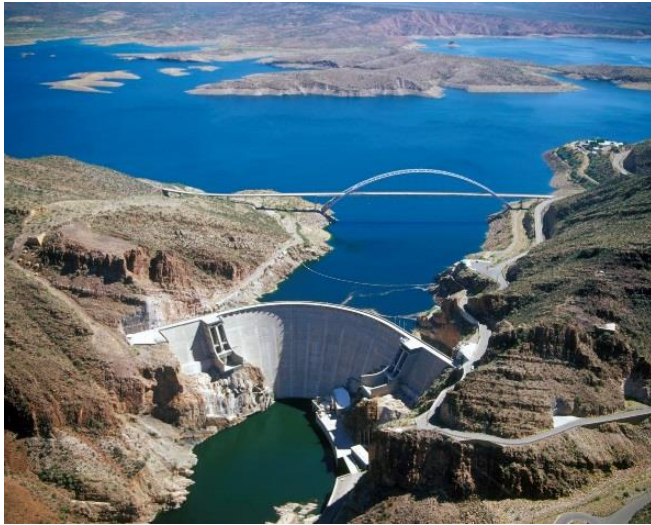
Roosevelt Dam.

Reclamation Technology Transfer – Although Reclamation’s R&D focuses on water and power issues specific to the arid and variable climates characteristic of the Western U.S., the new solutions, tools, and information developed can have broad applicability regardless of location or jurisdiction. The transfer of Reclamation’s technology and knowledge across the national and international communities of practice maximizes public benefits of Reclamation’s R&D investments.