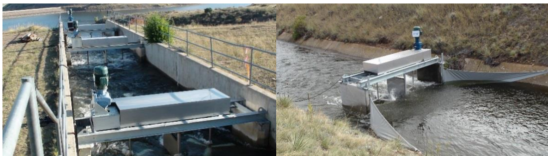
HK technologies installed at South Boulder Canal.

Reclamation’s contributions to the CRADA include technical expertise on collecting and analyzing data of hydraulic impacts to canal operation. Denver Water’s contributions include providing a test site at the South Boulder Canal for installing and testing HK devices, materials and equipment, and technical expertise in evaluating HK performance.