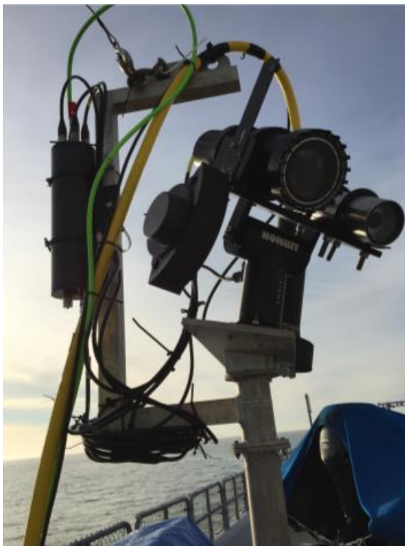
The combined sensors mounted on a tripod to be placed underwater with a video camera and underwater control computer.

The following are examples of publicly available research projects, completed or ongoing, in FY 2017, which would, among other things, advance technological options and transfer knowledge about best technological practices to industries and regulators operating on the OCS.