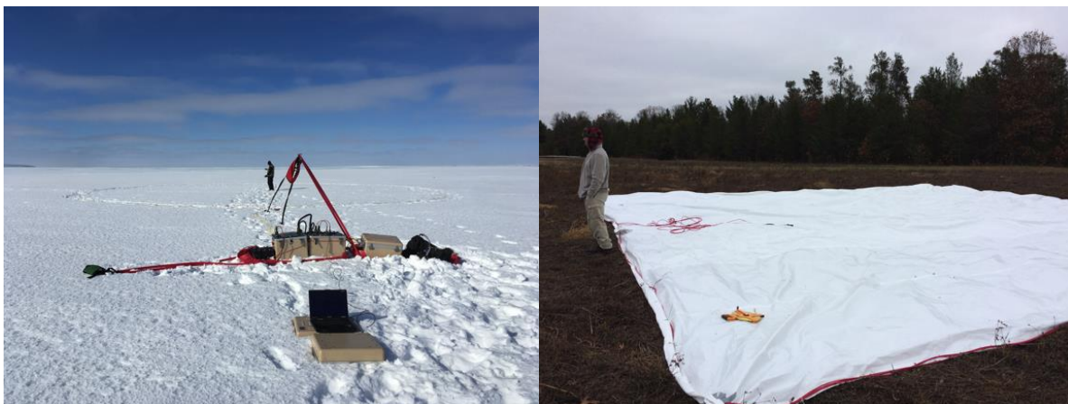
Field deployments of rapid scan instrumentation in Alaska (left) and Wisconsin (right)

In 2017, two demonstration efforts were undertaken to begin testing new hardware and software developments. The first was at a remote site on the North Slope of Alaska, where scientific questions involved detecting unfrozen water beneath snow and frozen sediments. Here, instruments were towed across the snow using sleds (see below). At a second field site in Wisconsin, NMR instruments were towed across farm fields on a large tarp to map the distribution of shallow groundwater and clay confining layers.