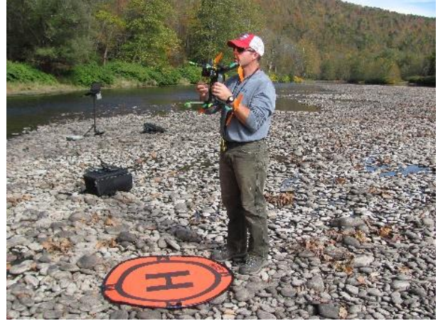
Researchers use unmanned aircraft with mounted thermal cameras to develop temperature maps of the river.