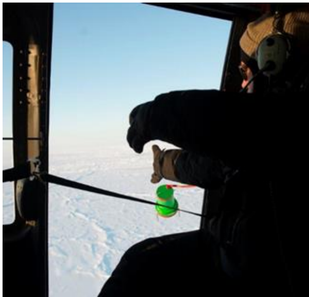
Deploying LDGRIDSAT tag from helicopter.

Tagging of Oil under Ice-Phase II: Ice Floe Tracking System: This project is to enhance the