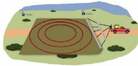
Conceptual diagram of a towable surface NMR platform.

following illustration, transform surface-NMR into a mobile scanning method for rapid mapping of hydrogeologic properties, providing orders of magnitude improvements in measurement speed, cost-efficiency, and success-rate. This valuable technology will redefine practical capabilities for non-invasive mapping of aquifer parameters, and advance customers' ability to successfully remediate, protect, and manage groundwater resources.