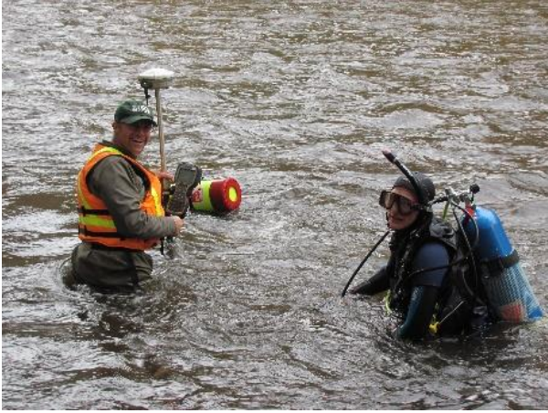
Researchers SCUBA dive to deploy fiber-optic temperature sensing cable on the bottom of the river to develop thermal maps of the river bottom.