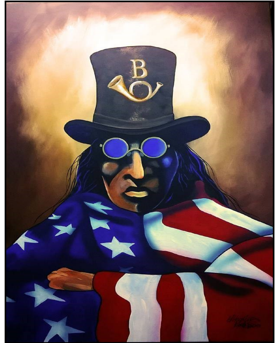
Boogie Woogie Bugle Boy of Company B