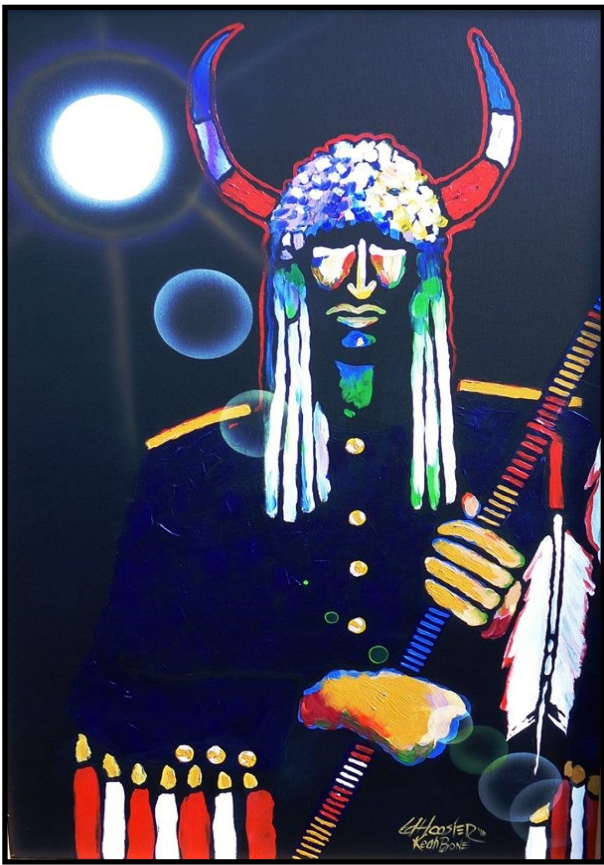
The Sentinel Acrylic on canvas © 2017 Ed Hoosier