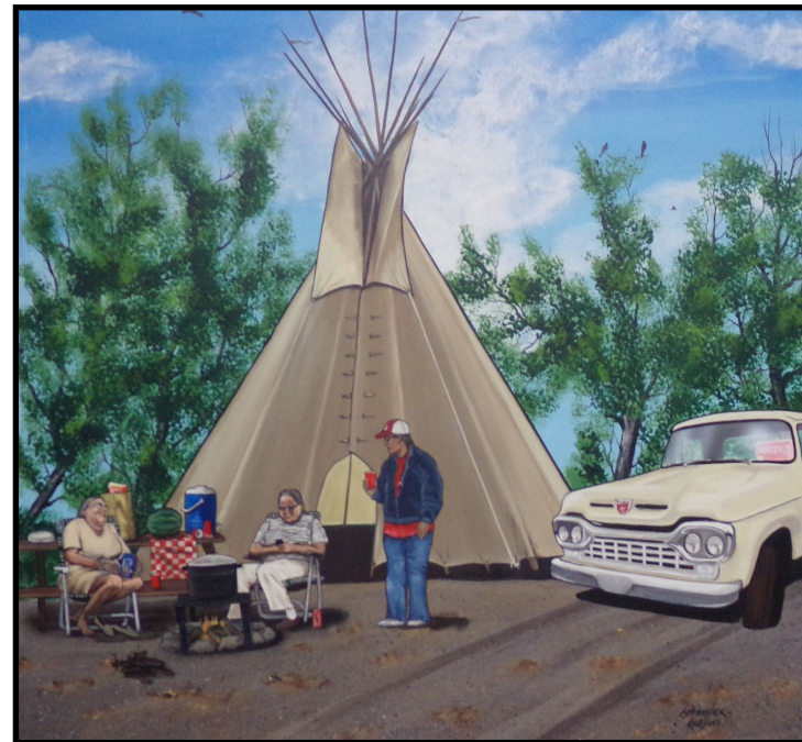
Comanche Homecoming Acrylic on canvas © 2017 Ed Hoosier