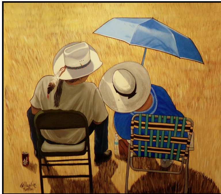
Summertime Blues Acrylic on canvas © 2017 Ed Hoosier