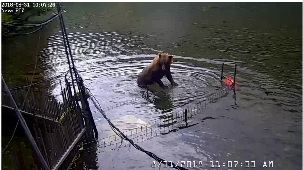
Figure 2. Surveillance video capture of a bear looking into the video chute at the Neva Lake video weir, while leaning on the beaver-deterrent fence around the chute exit.