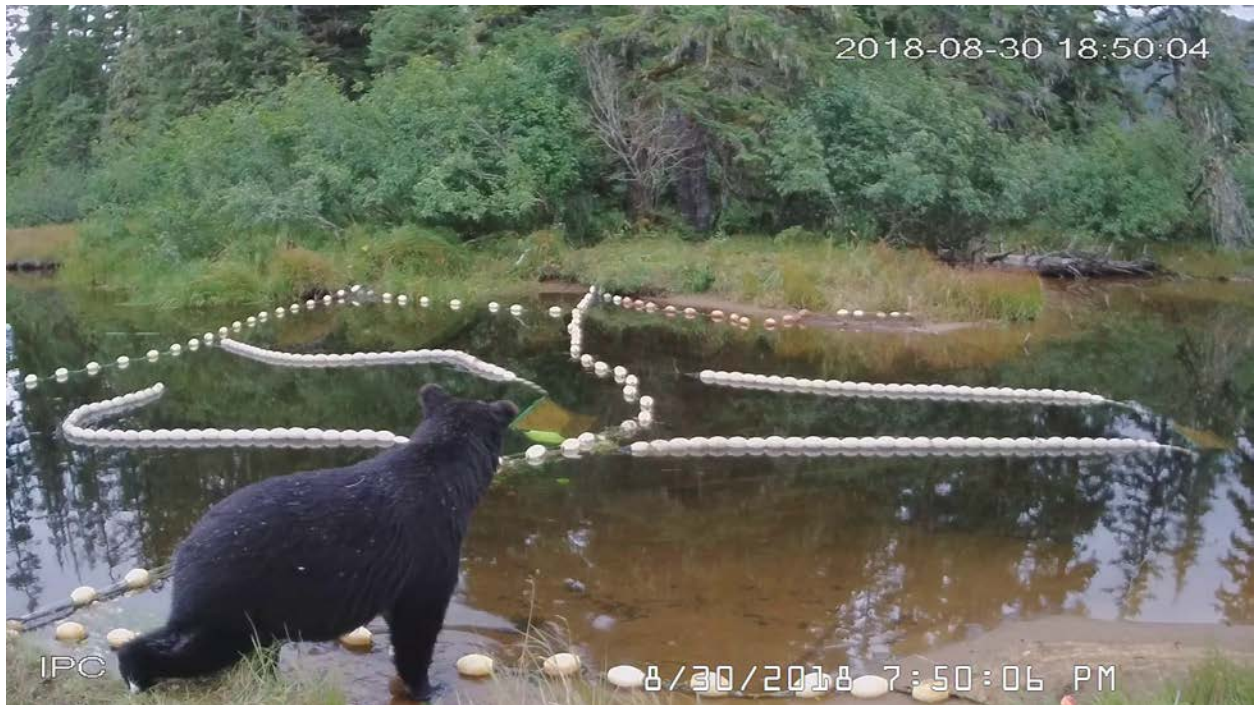
Figure 4. Surveillance video capture of a brown bear looking at the Sitkoh Lake net weirs.

Prince of Wales and Ketchikan District Area – Jeff Reeves, Forest Service, Tongass National Forest. (907) 826-1649 jreeves@fs.fed.us