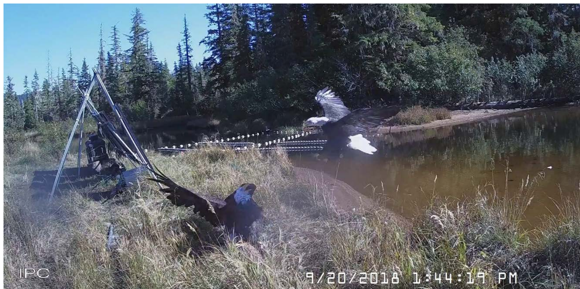
Figure 2. Surveillance video capture of a pair of eagles battling over a salmon carcass near the Sitkoh Lake video weir, 2018.

This will be my last weekly summary submitted for the 2018 season. Please contact me if you have questions.