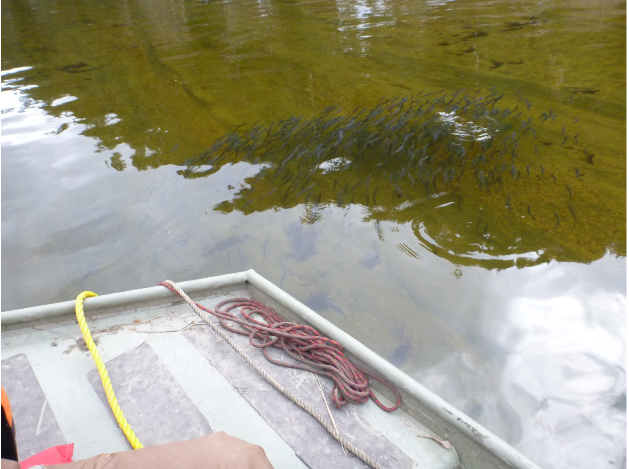
Small school of Eulachon noted in the Eulachon River, 2019