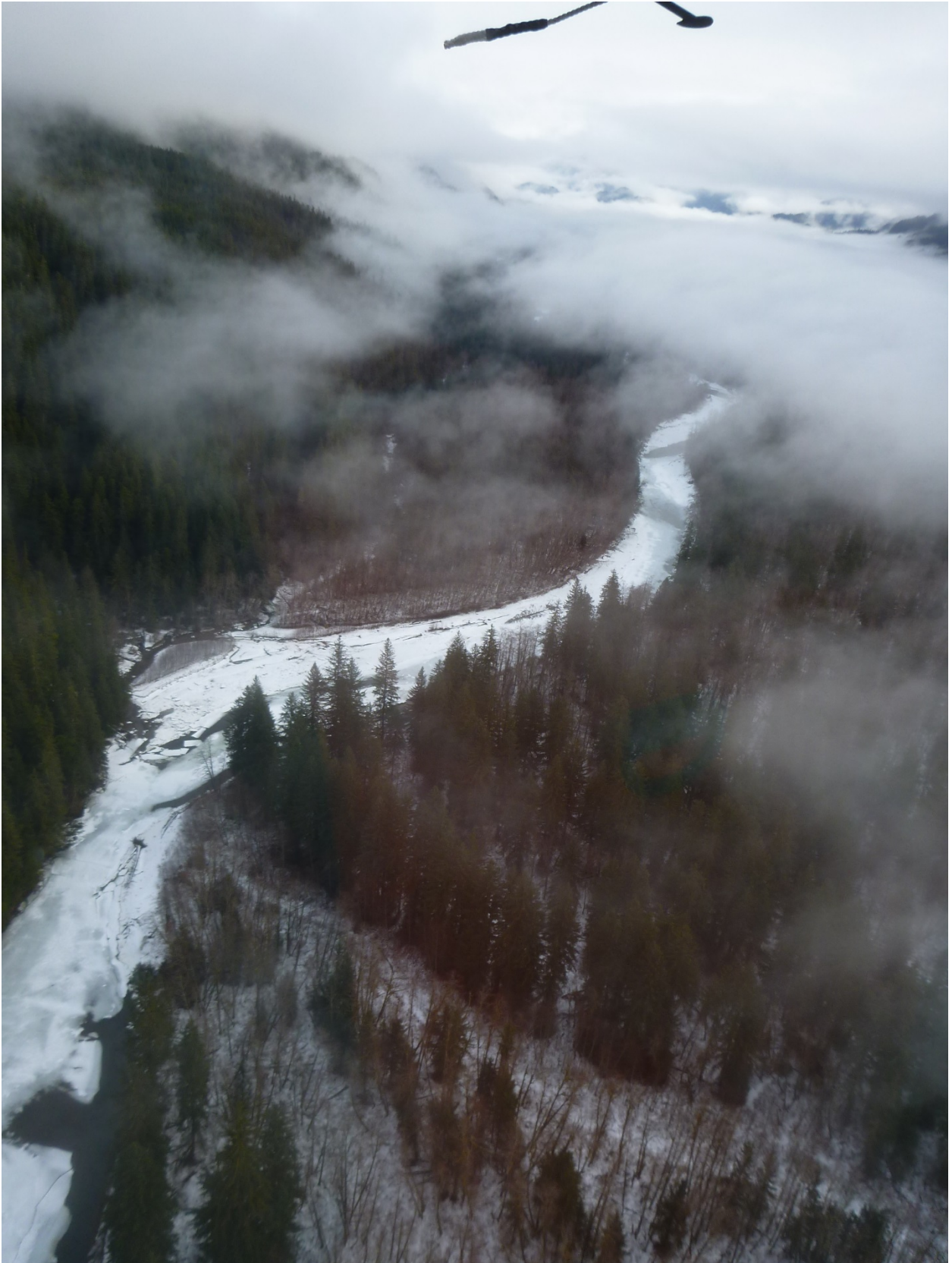
Upper Landing Slough area of the Unuk River during March 12, 2019 aerial survey