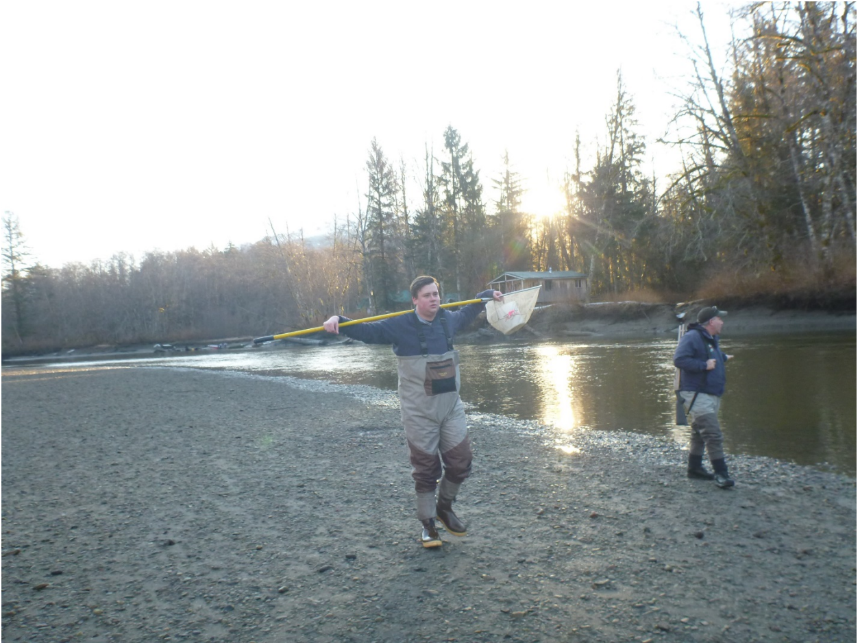
March 20, 2019 walking survey at low tide to assess for Eulachon presence in the Unuk River.