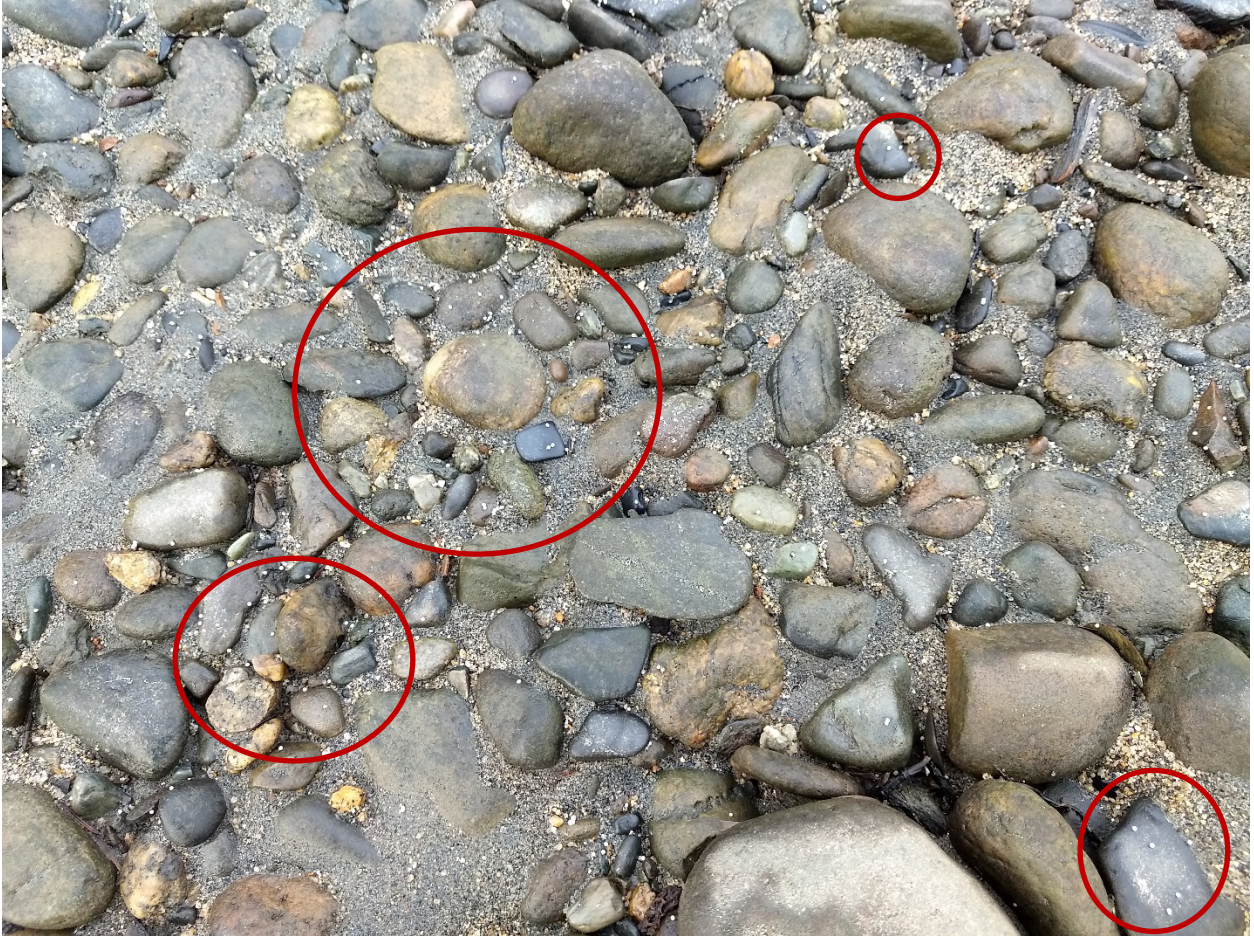
Light presence of Eulachon eggs in red circled areas