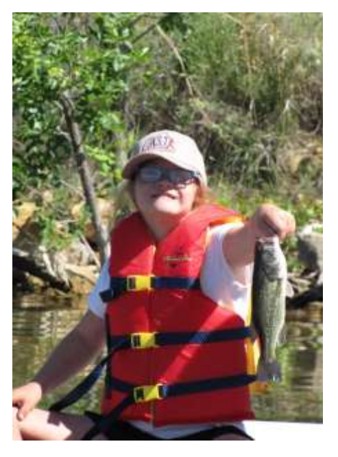
Showing the catch of the day at Reclamation's Angostura Reservoir in South Dakota.

The most important aspect of these events is to make quality outdoor recreation on Reclamation reservoirs accessible to all. At each event, children receive a rod/reel, a tackle box, a T-shirt, an award with their photo in it, and other prizes. They spend the morning fishing with local anglers who volunteer their time, use of their boats and their fishing expertise with the participants. After fishing, volunteers serve a free picnic lunch to participants, parents and volunteers. The event concludes with the Award Ceremony where each child receives a plaque containing their photo. These outdoor recreational opportunities have benefited thousands of children and their families since 1991.