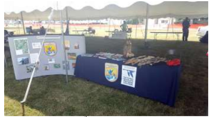
The FWS booth at the 48<sup>th</sup> Annual Saginaw African Cultural Festival

Environmental Learning Center. Like the festival, the Center is located within the City of Saginaw, an urban setting a few miles or blocks from more than 40,000 residents. Refuge staff also led appealing conversations about recreational opportunities on the refuge and its upcoming open house weekend. Pelts and interactive touch bags added thrills as visitors of all ages tried to guess what object or specimens