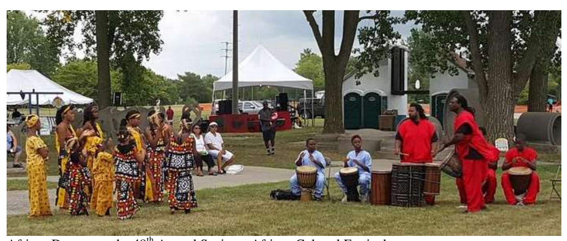
African Dancers at the 48<sup>th</sup> Annual Saginaw African Cultural Festival

were inside. A few thousand people attended this festival over the weekend.