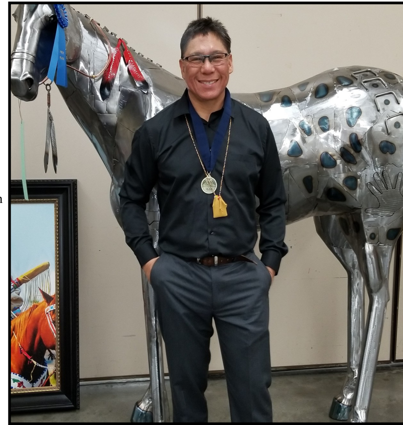
Red Earth War Pony Sculpted Metal © 2019 Gene “Ironman” Smith