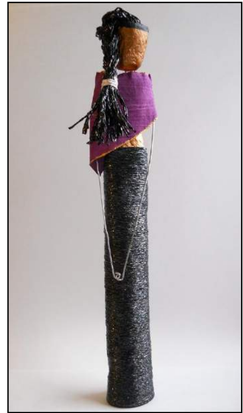
Prairie Goddess Paper mache, VHS tape, and paper clips © 2015 Melanie Ratzlaff