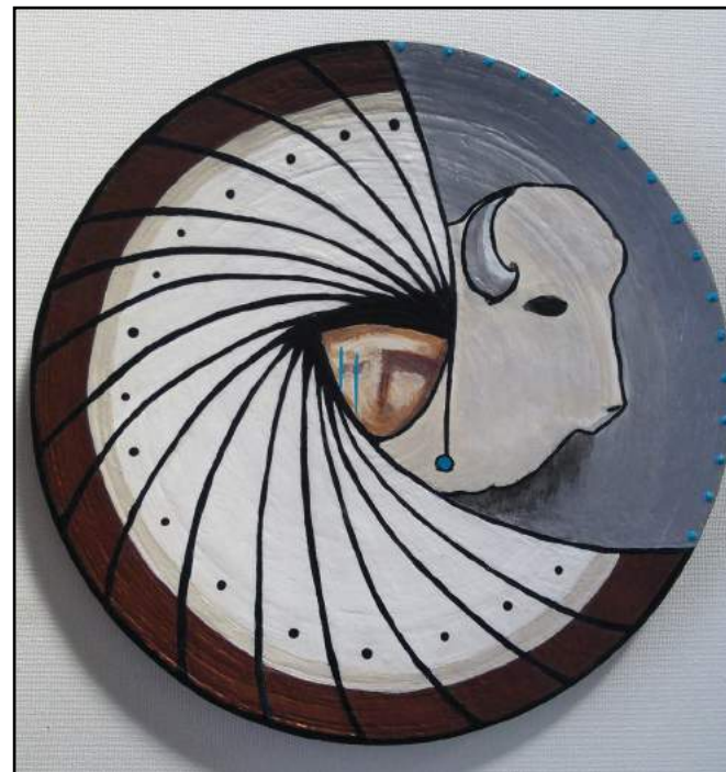
Warrior Spirit Acrylic paint on rolled paper © 2015 Melanie Ratzlaff