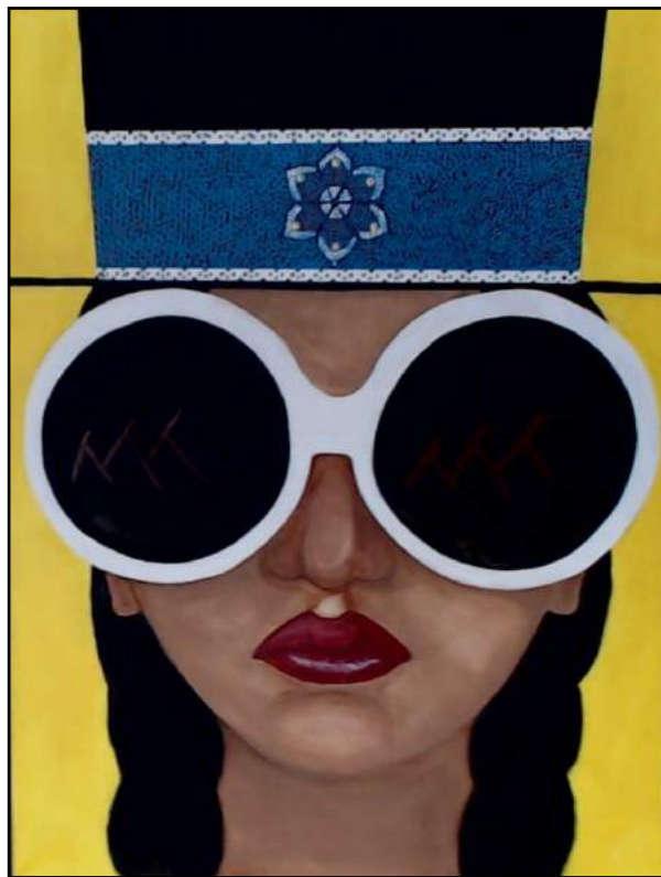
Iris Acrylic on canvas © 2015 Melanie Ratzlaff