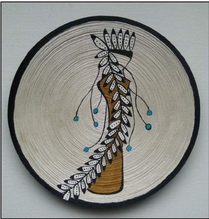
Solemn Acrylic paint on rolled paper © 2014 Melanie Ratzlaff