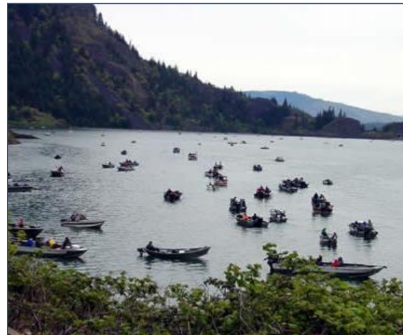
Drano Lake Recreation Area