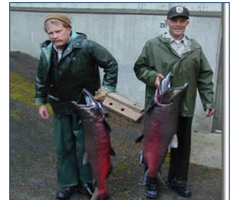
Chinook salmon – Listed Species