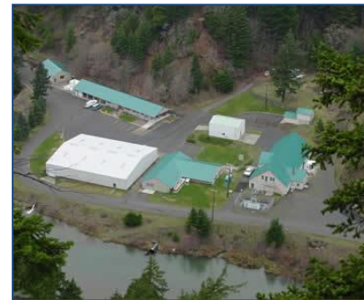
Little White Salmon Fish Hatchery FWS Facility