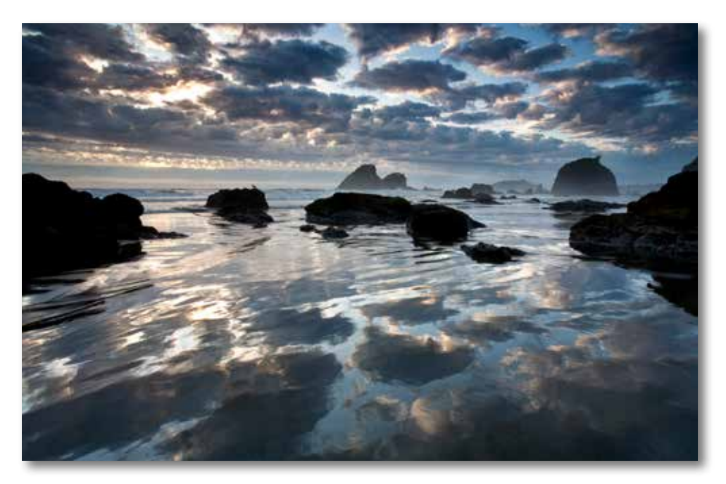
Our coastal waters connect us to special places--From the rocky beaches of the Pacific Northwest to the diverse corals sheltered among the mangroves in the Caribbean islands.