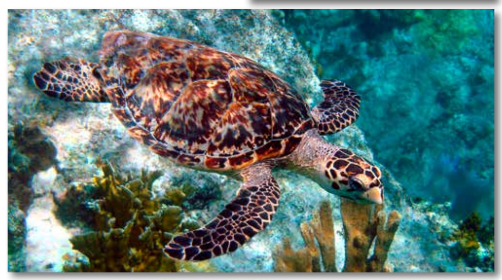
This page: Top: An adult female green sea turtle feeds on seagrass near Culebra Island off the east coast of Puerto Rico. Middle: The turtle shell's carapace of a live juvenile green turtle. Bottom: An endangered hawksbill turtle ( Eretmochelys imbricata ) in the U.S. Virgin Islands. Opposite page: (clockwise from top left): USGS scientists release a loggerhead sea turtle ( Caretta caretta ) after collecting data and tagging in Dry Tortugas National Park, FL.