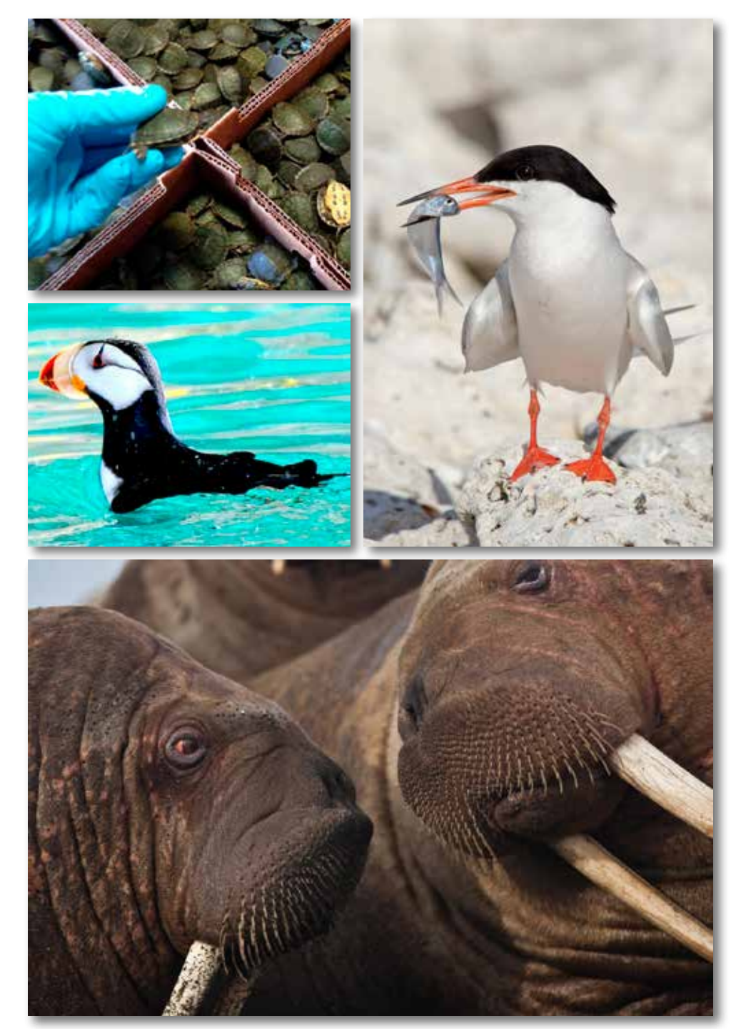
Clockwise from top left: Turtles are inspected as part of a global anti-wildlife trafficking initiative. The threatened roseate tern, with its bright orange breeding coloring, just had a successful fishing venture. Walruses like to be in constant contact with other walruses. A horned puffin in Alaska Maritime National Wildlife Refuge, AK.