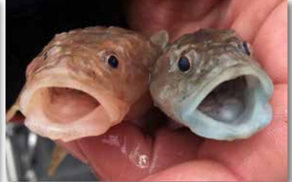
Top: Matt Whitbeck, wildlife biologist at Chesapeake Marshlands National Wildlife Refuge Complex, conducts a plot survey of high-marsh vegetation, including seaside goldenrod, which is important for pollinators like monarch butterflies. Bottom right: Red and blue color variants of deepwater sculpin from a Lake Ontario prey fish survey aboard the GLSC's R/V Kaho. The blue coloration naturally occurs and is due to a bile pigment called biliverdin that is more prevalent in some individuals. Bottom left: A photomicrograph of a single living cell of a freshwater green alga ( Micrasterias radiosa ), that is illuminated with ultraviolet light. This sample was collected in Loxahatchee National Wildlife Refuge, FL.