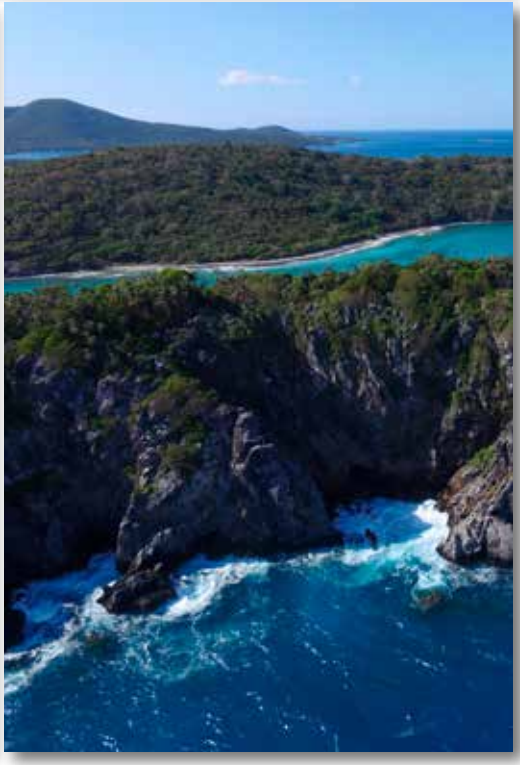
Opposite page (clockwise from top): Looking down on Trunk Bay, part of the U.S. Virgin Islands National Park where USGS and the NPS collaborate to manage sea turtles, coral reefs, mangroves, and seagrass beds within this popular recreational area. Juvenile lake sturgeon raised at the Genoa National Fish Hatchery in Wisconsin. Brown pelicans (left) and snowy plovers (right) were among at least 93 species of birds that were exposed to oil in the 2010 Deepwater Horizon spill. DOI's restoration planning addresses a broad diversity of injured bird species. This page (clockwise from top): Young students enjoy dipnetting for marine critters at Biscayne National Park. Steven Cay, U.S. Virgin Islands. Topobathymetric map of the mouth of Tampa Bay where it enters the Gulf of Mexico, F.L.