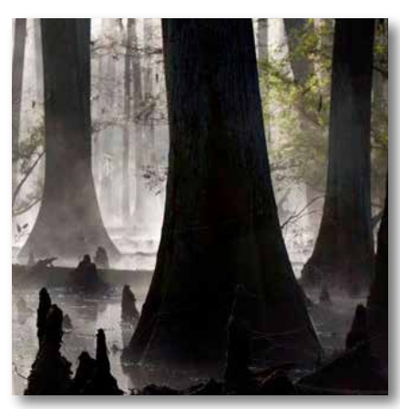
This page, clockwise from top: The beach at Trinidad Head, California Coastal National Monument, CA. Photo credit: Bob Wick, BLM; Osprey in nest in Chesapeake Bay, MD. Photo credit: Pete McGowan, USFWS; A wet cypress tree forest in the Red River National Wildlife Refuge, LA. Photo credit: USFWS