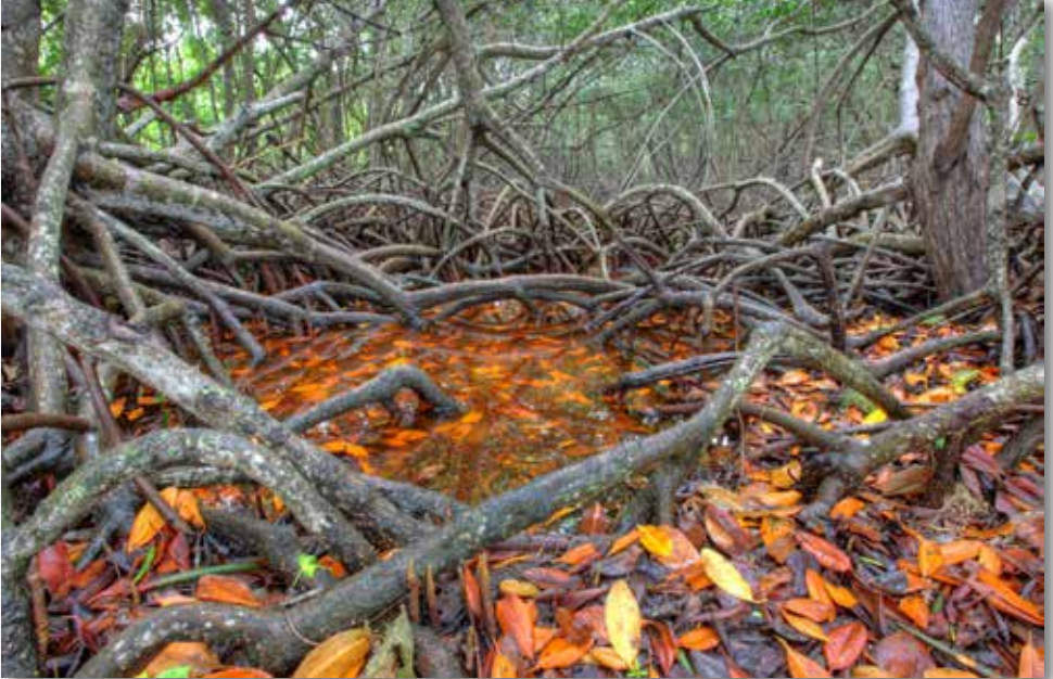
Top: White terns breed on the uninhabited Howland Island National Wildlife Refuge which is part of the Pacific Remote Islands Marine National Monument. Photo credit: Megan Nagel, USFWS; Bottom: Red mangrove ( Rhizophora mangle ) roots at Everglades National Park. Photo credit: G. Gardner, NPS