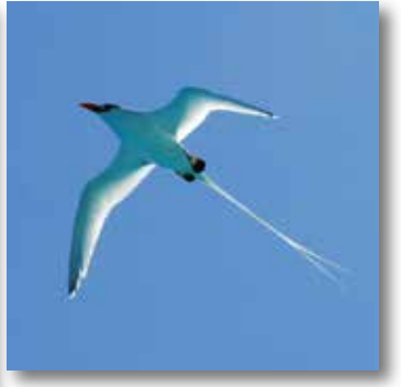
Interior's Diverse Role--