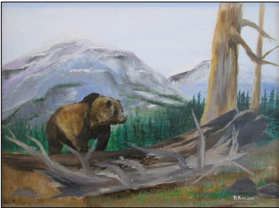
Bear in the Wilderness Acrylic on canvas © 2019 Newton Racine