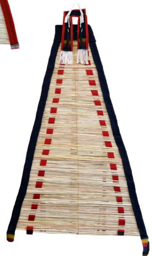
Blackfeet Willow Backrest Willows, tradecloth, sinew, leather © 2019 Joanne Caddotte