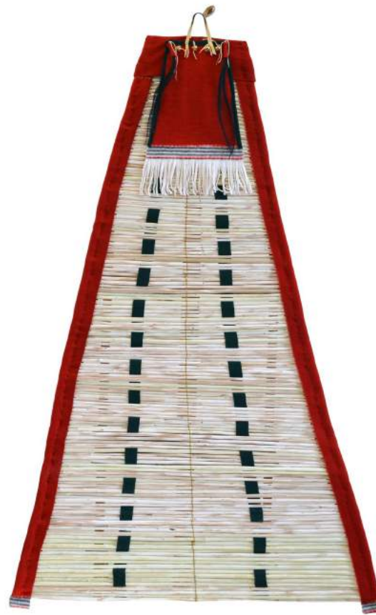
Blackfeet Willow Backrest Willows, tradecloth, sinew, leather © 2019 Joanne Caddotte