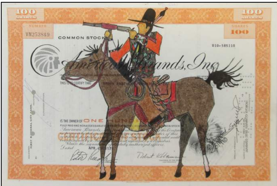
Kutoyistiiksi (Sweet Pine Hills) Colored pencils and ink on antique ledger paper © 2019 Preston Spotted Eagle